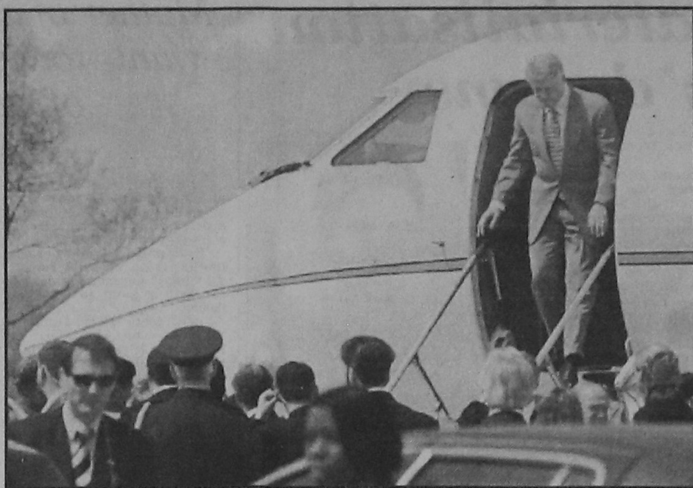
US President Bill Clinton prepares to get off a plain colour Gulfstream jet at Islamabad International Airport yesterday. Clinton was scheduled to meet with Pakistan's President Muhammad Rafiq Tarar and General Pervez Musharraf yesterday. Clinton is on the final stop of his six-day trip to South Asia.

Russia, he said, was "one of the biggest countries in the world and a mighty nuclear power."