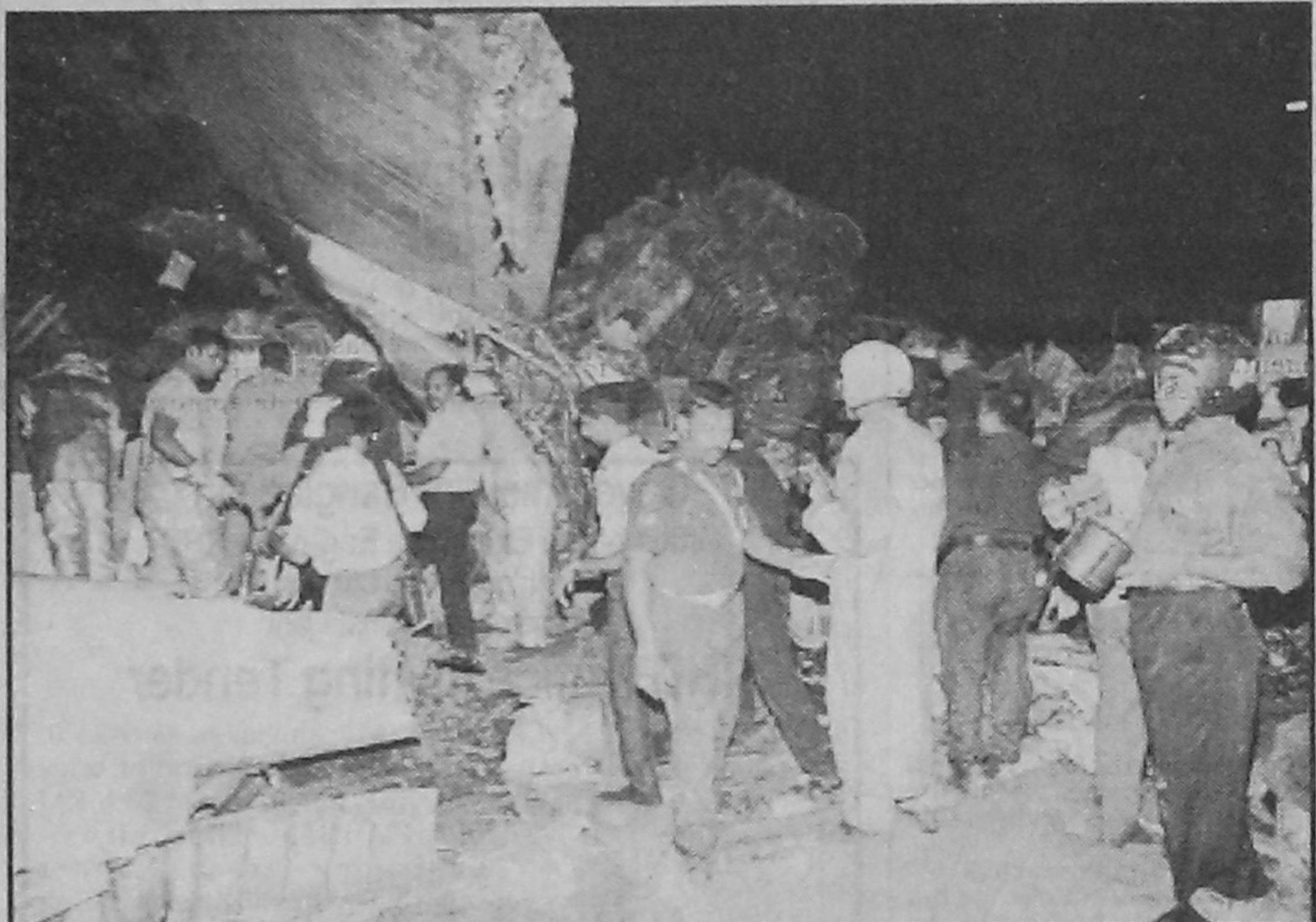
Rescue workers look for victims trapped under the wreckage of Antonov-12 cargo plane that crashed onto several houses Friday in Kadirana, near Sri Lanka's only international airport. At least six crewmen - five Russian and one Sri Lankan - were killed and two people on ground also perished in the crash during bad weather while many more escaped with injuries. The aircraft broke into several pieces and the main wings rested on a brick wall of a house.

Community volunteers set up an emergency center with trauma counselors to help parents who feared their children might have been caught in the stampede.