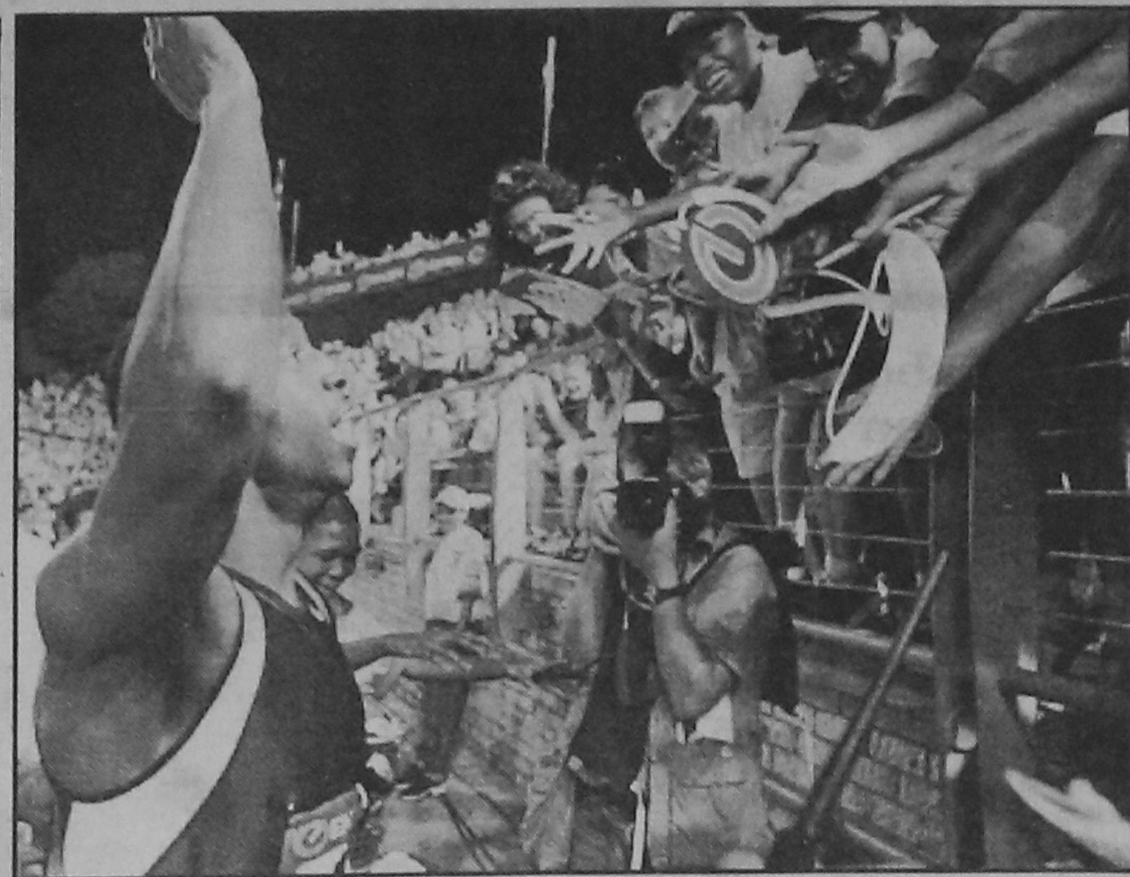
American Michael Johnson greets the crowd at the Pilditch Arena in Pretoria on March 24. He set a new record in the 300 metres clocking 30.85 seconds.