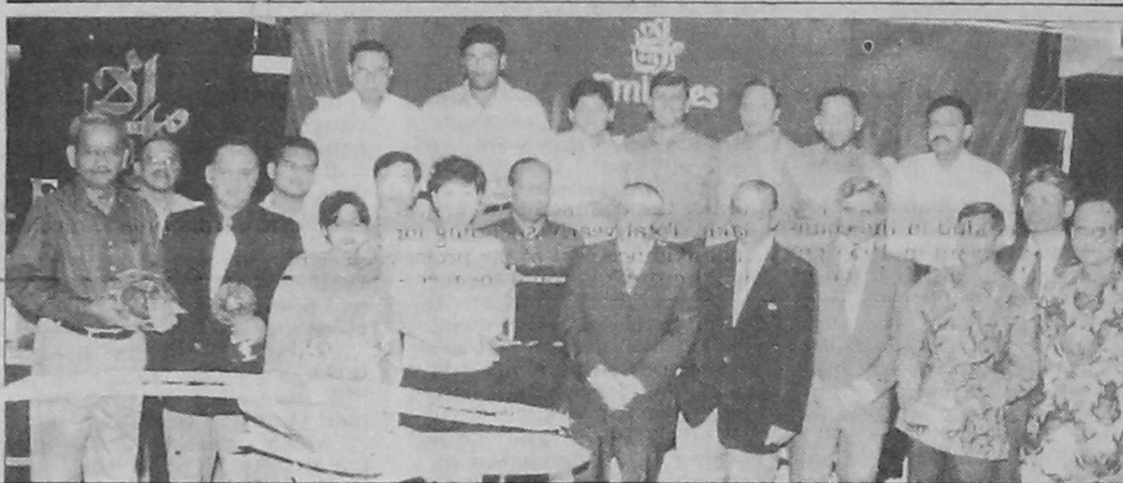
Winners of the third Emirates Cup Golf Tournament pose with their trophies at the Kurmitola Golf Club on Friday.