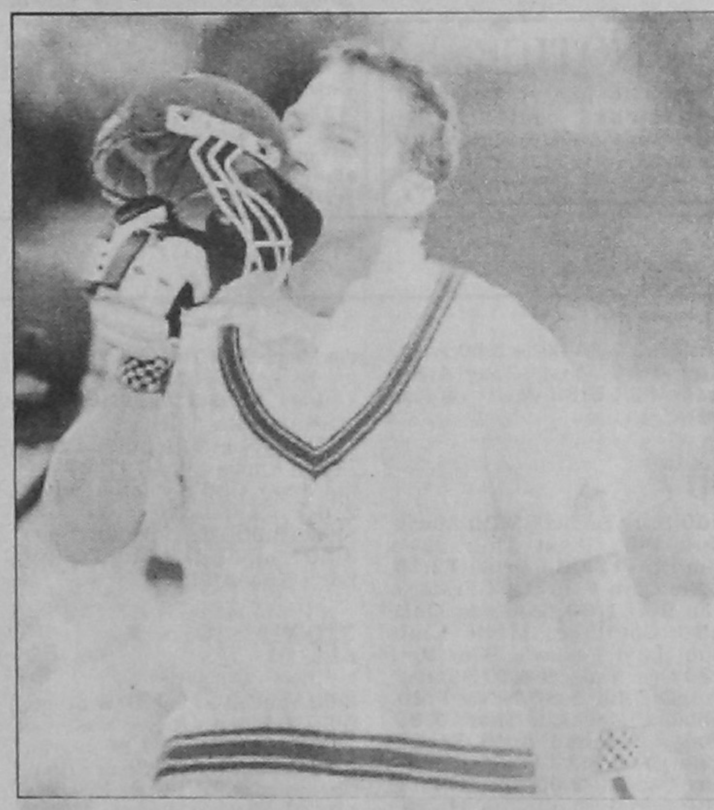
Australia's Michael Slater kisses his helmet after reaching 100 in the second Test against New Zealand at Wellington yesterday.