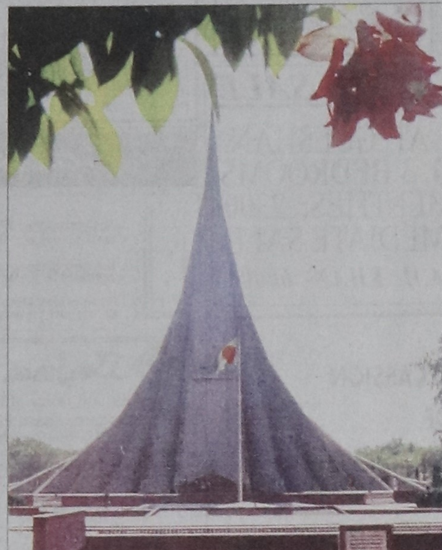
The National Memorial at Savar.