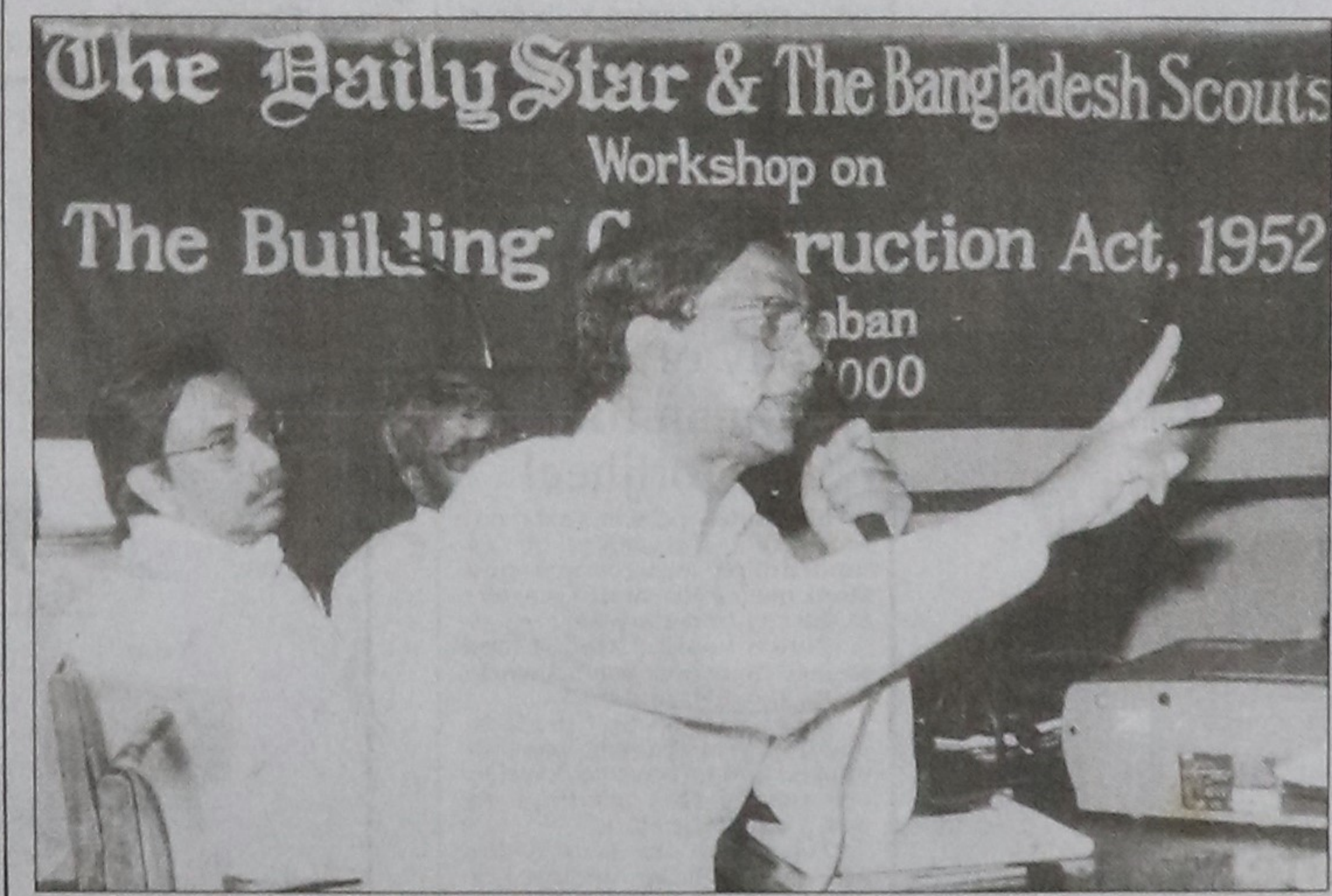
Dhaka City Corporation Mayor Mohammad Hanif making a point at the workshop on 'The Building Construction Act, 1952,' organised jointly by The Daily Star and Bangladesh Scouts at Scout Bhavan in the city yesterday.