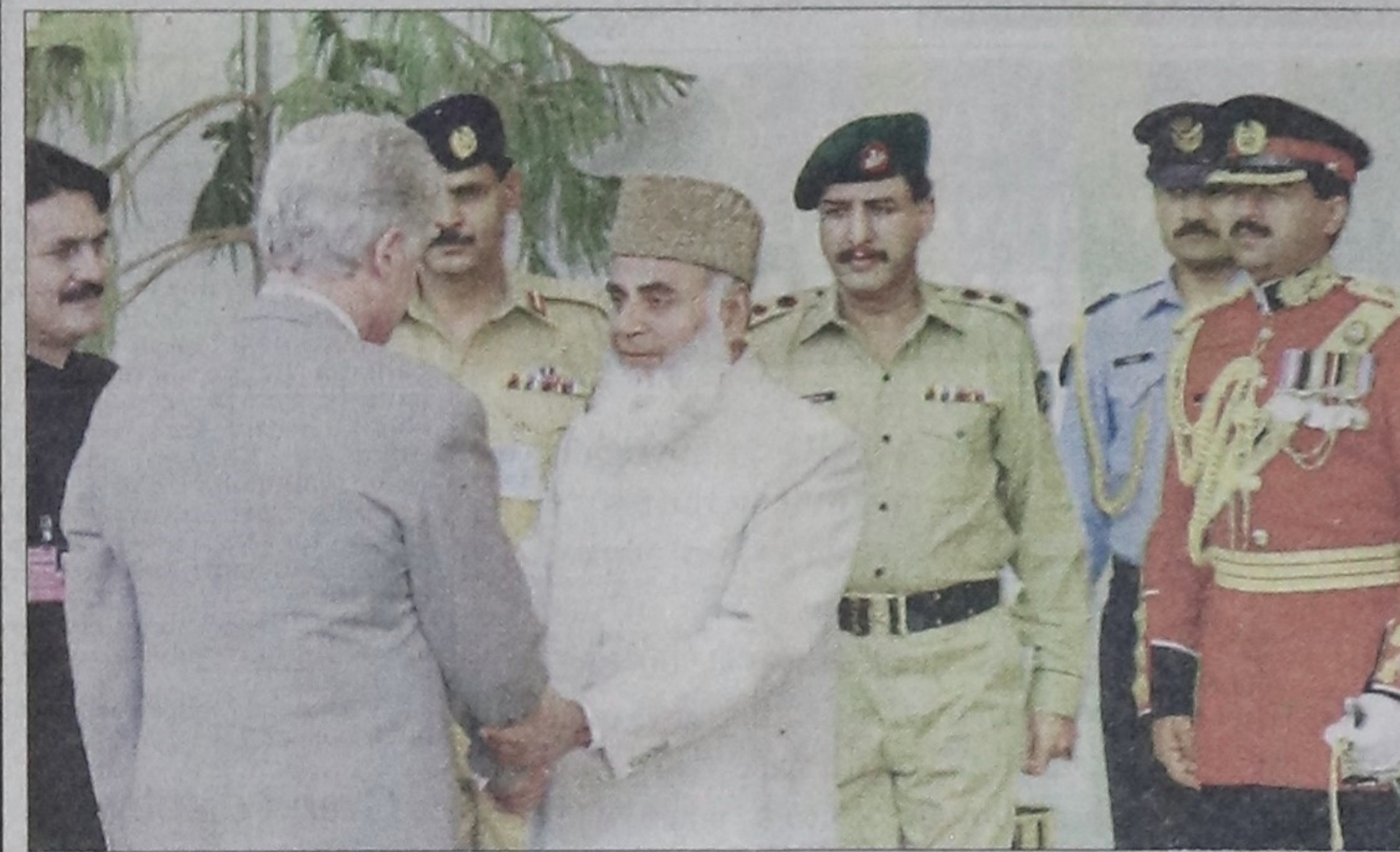
US President Bill Clinton (L) who arrived in Pakistan for a 5-hour visit, shakes hands with Pakistani President Muhammad Rafiq Tarar (C) as Pakistani military officials look on, in Islamabad yesterday.