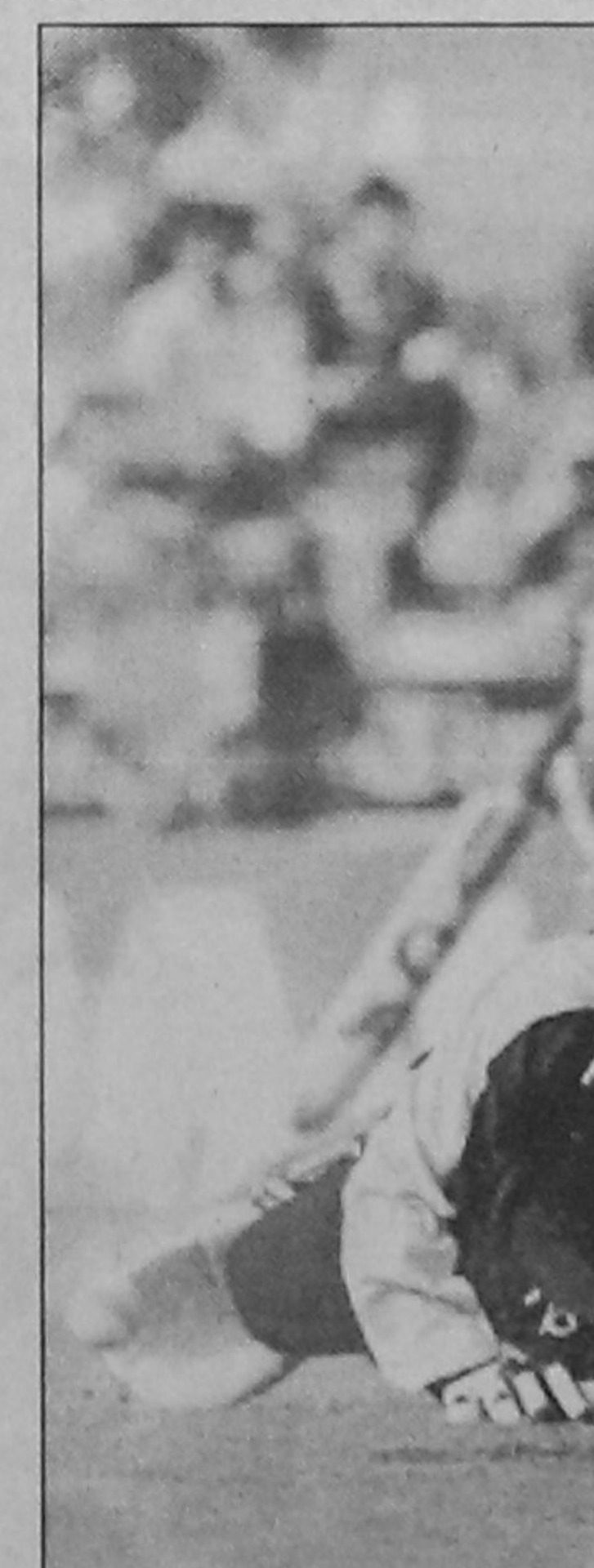
Pakistan's Imran Nazir dives to make his ground as vice-captain Inzamamul Haq looks on in Game Two of the Coca-Cola Cup in Sharjah yesterday.

A record 147 players will take part in the tournaments.