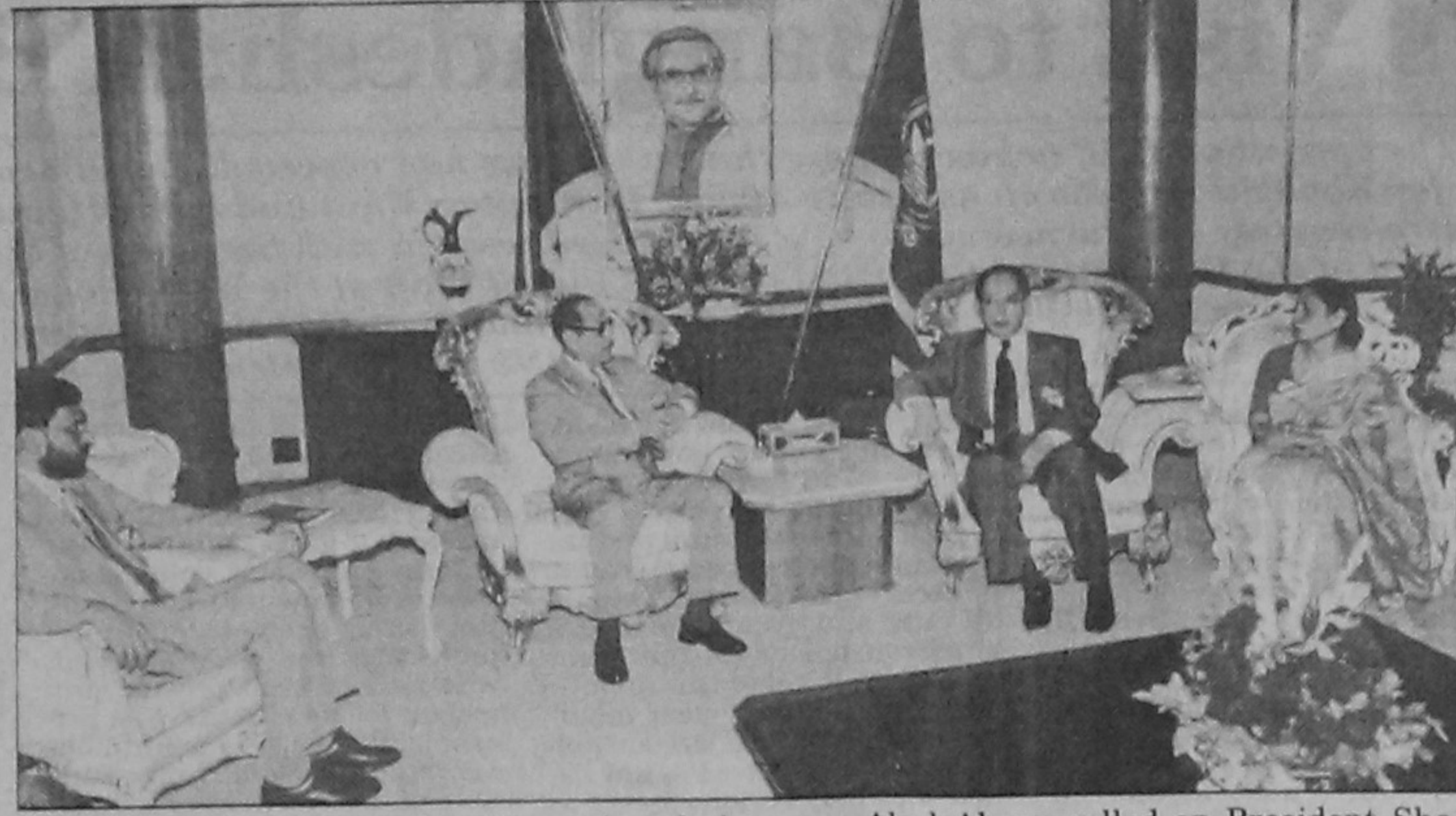
A delegation of FEMA led by its acting chairperson Abul Ahsan called on President Shahabuddin Ahmed at Bangabhaban yesterday.

A 8-day solo painting exhibition by Kanak Chappa Chakma will begin tomorrow at the Shillpangan art gallery in the city, says a press release. Governor of Bangladesh Bank Dr Mohammad Farashuddin will inaugurate the exhibition at 5 pm. The show will remain open from 10 am to 8 pm daily till March 31. Recent works of the artist will be put on display.