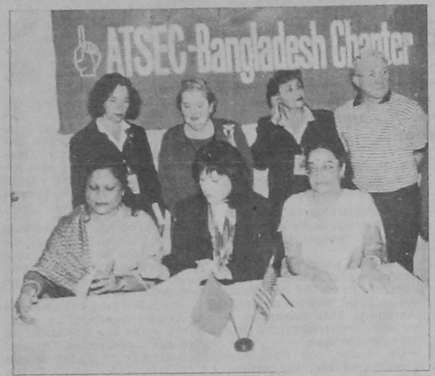
US Secretary of State Madeleine Albright (2nd L) witnesses the signing of a USAID grant for Action Against Trafficking and Sexual Exploitation of Children (ATSEC), an NGO network, on Monday.