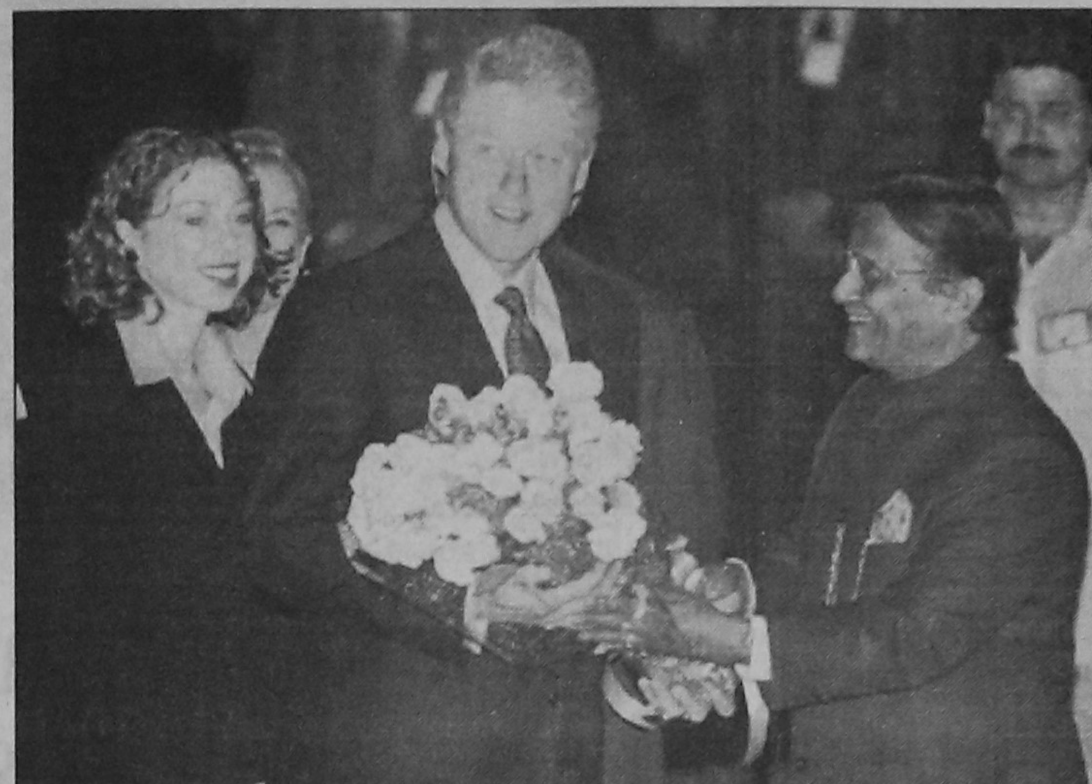
US President Bill Clinton (C) is offered flowers by Indian State Minister for External Affairs Ajit Panja (R) upon his arrival at Palam Air Force Base in New Delhi Sunday as his daughter Chelsea Clinton looks on. Clinton arrived for a six-day South Asian tour.

"Staying away only would strengthen hardliners in Pakistan who want their country to turn away from the world."