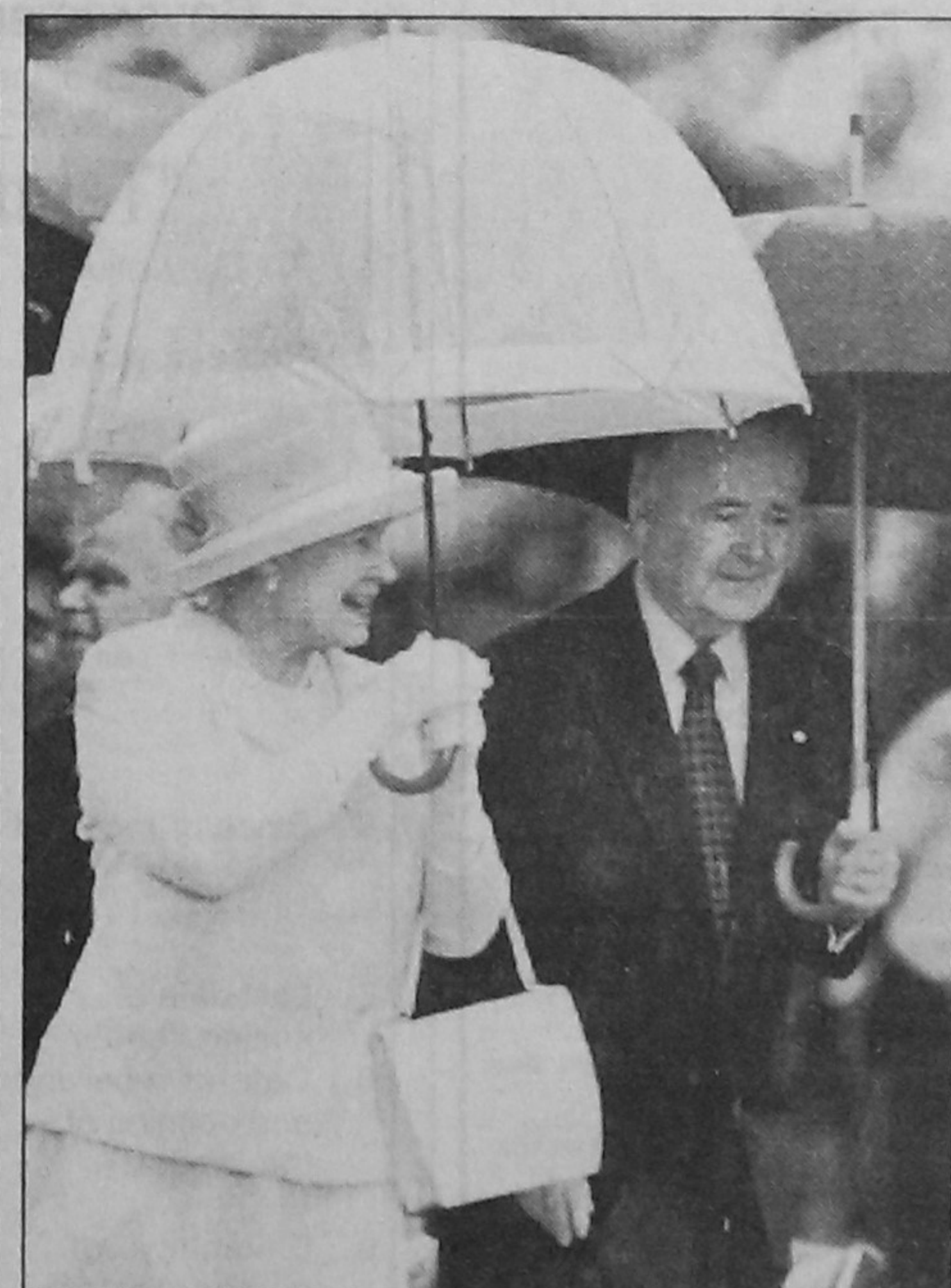
Britain's Queen Elizabeth II (L) is escorted by Sir William Deane (R), Governor-General of Australia, during an official welcoming ceremony in front of the Sydney Opera House yesterday. The British monarch is in Australia on a 16-day nationwide visit, her first since 1992.