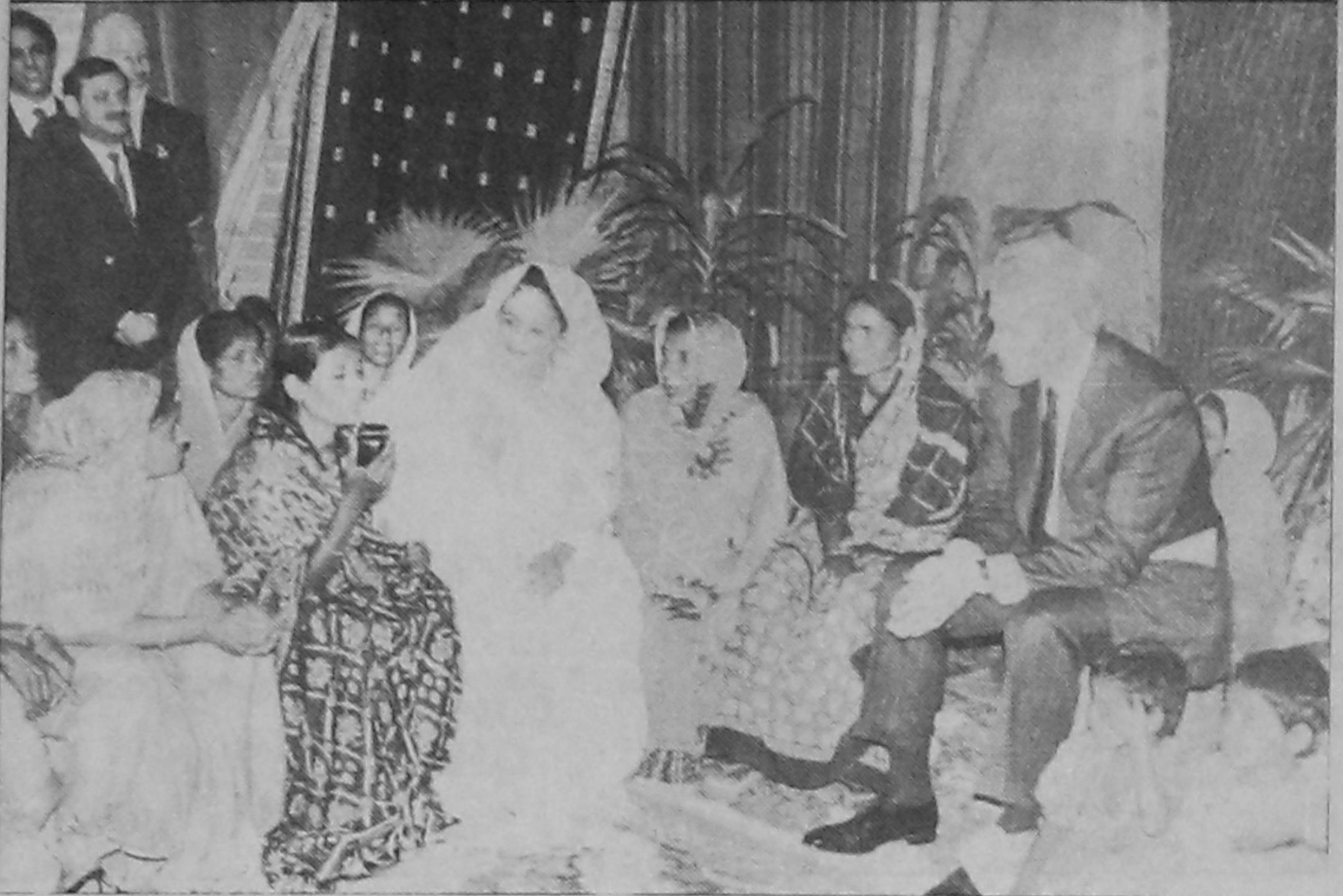
US President Bill Clinton and Prime Minister Sheikh Hasina with the women workers of Grameen Bank at US Embassy in the city yesterday. The women workers came from village Joypura.