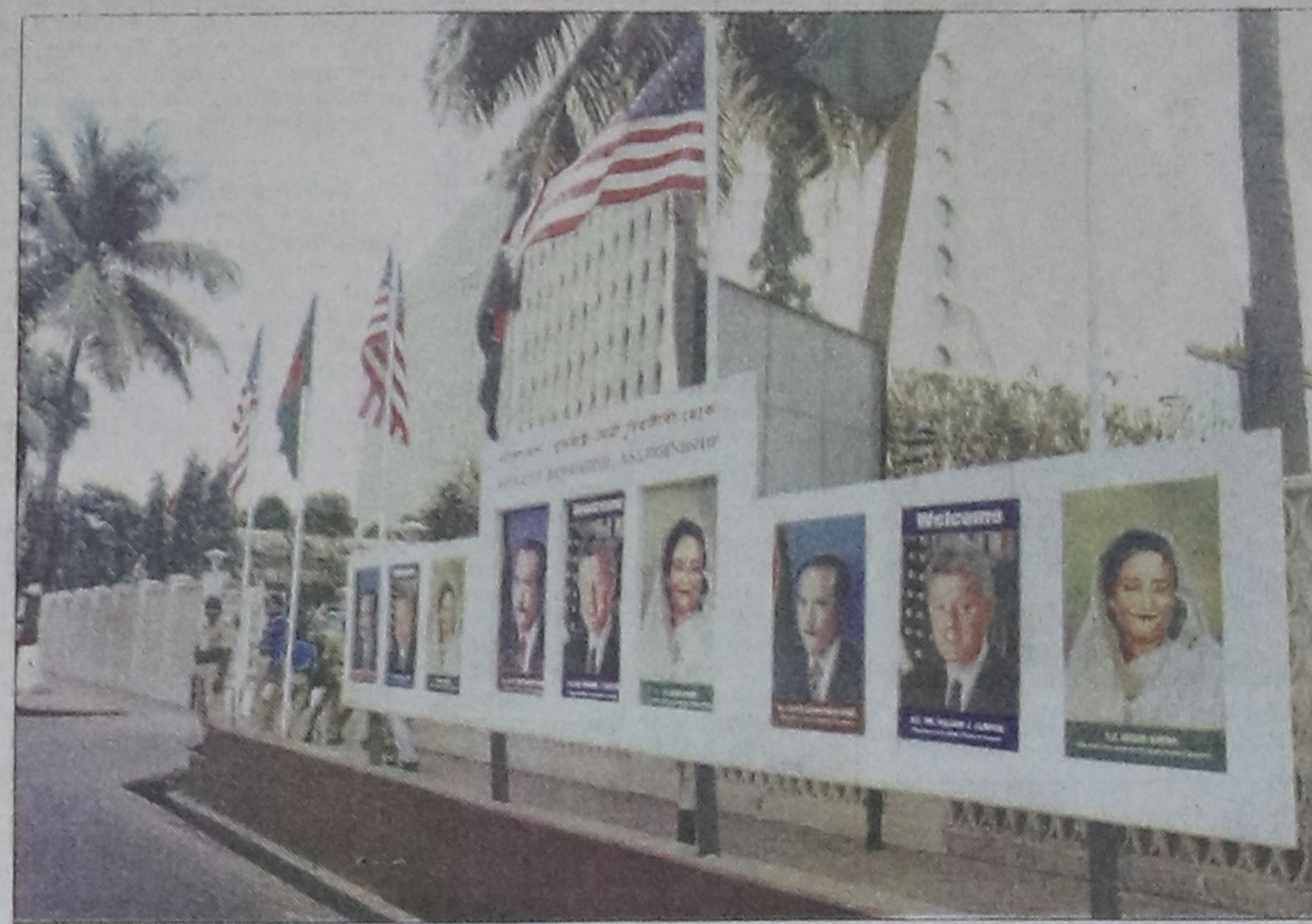
Billboards such as this one outside Hotel Sheraton welcome US President Bill Clinton to Bangladesh.