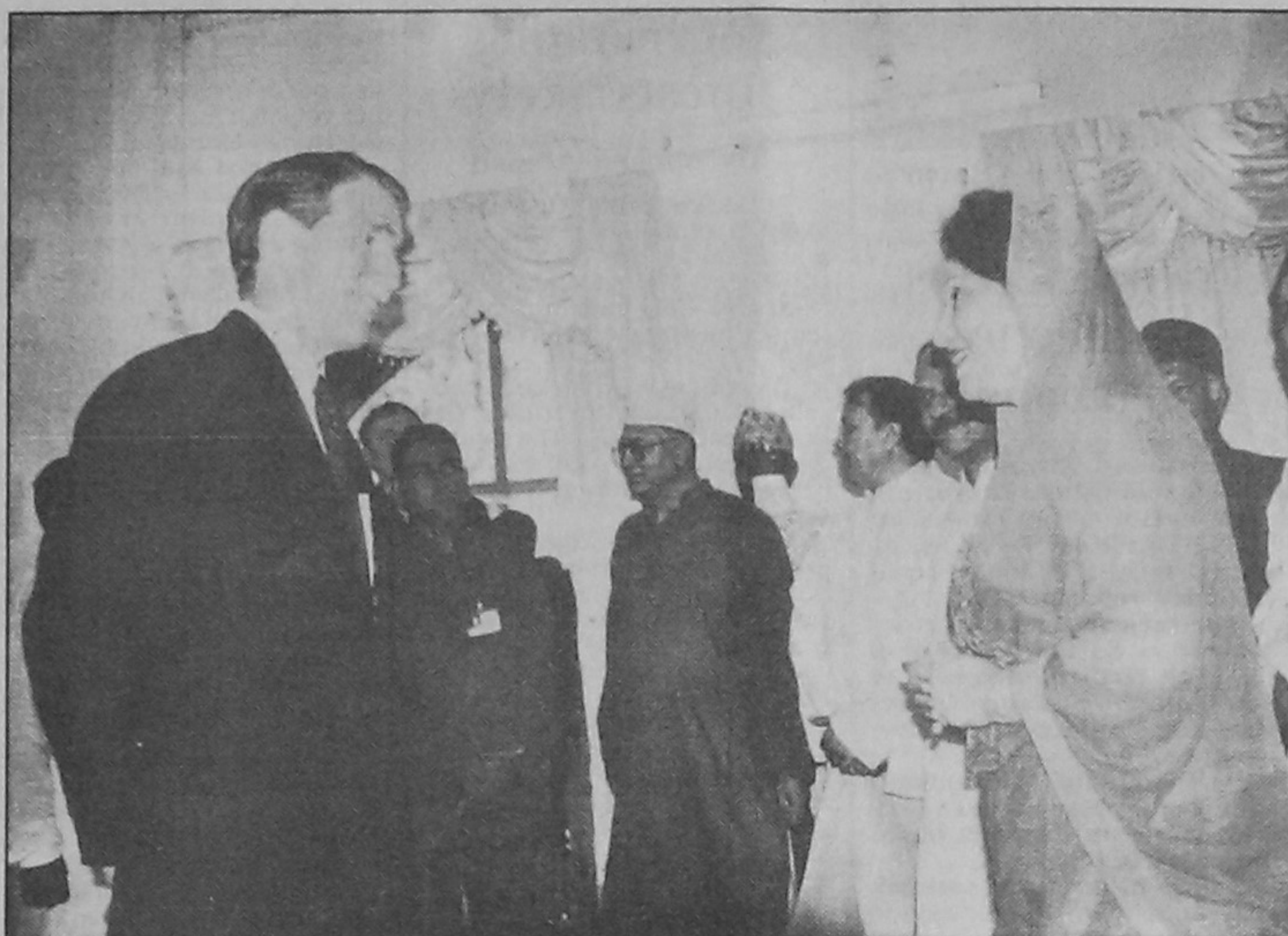
Leader of the Opposition in Parliament and BNP Chairperson Begum Khaleda Zia hosted a reception for diplomats and politicians on the occasion of Eid-ul-Azha at her Minto road official residence on Friday.