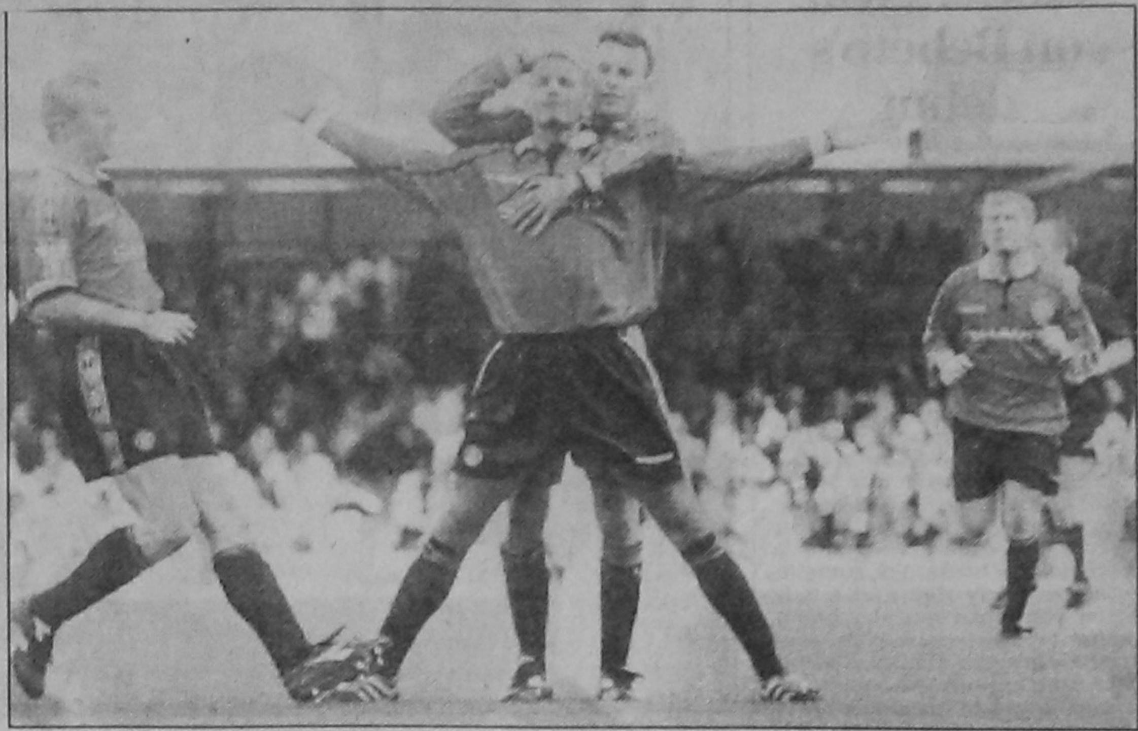
Manchester United's David Beckham spreads his hands for joy as his teammates rush towards him to congratulate after he has scored against Leicester in their Premiership encounter on March 18.