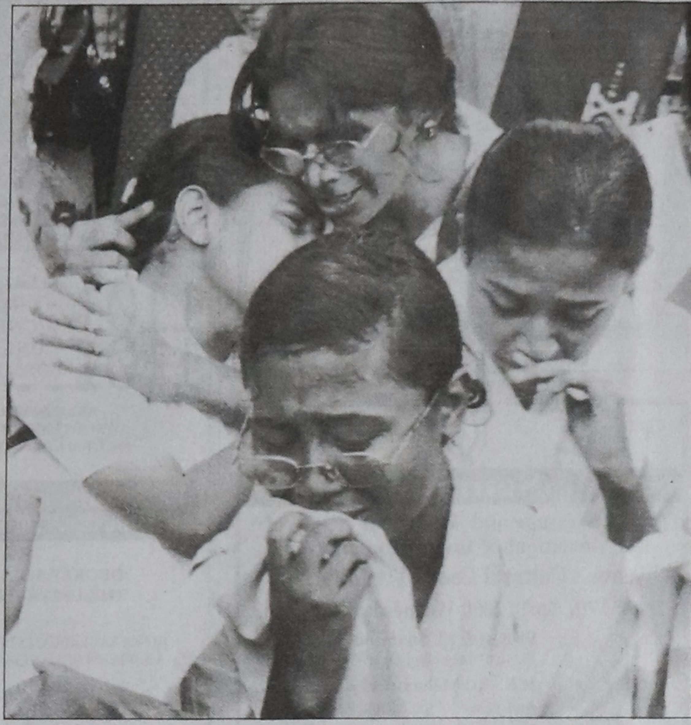
Some of the Motijheel Model College students burst into tears during the sit-in on the campus yesterday.