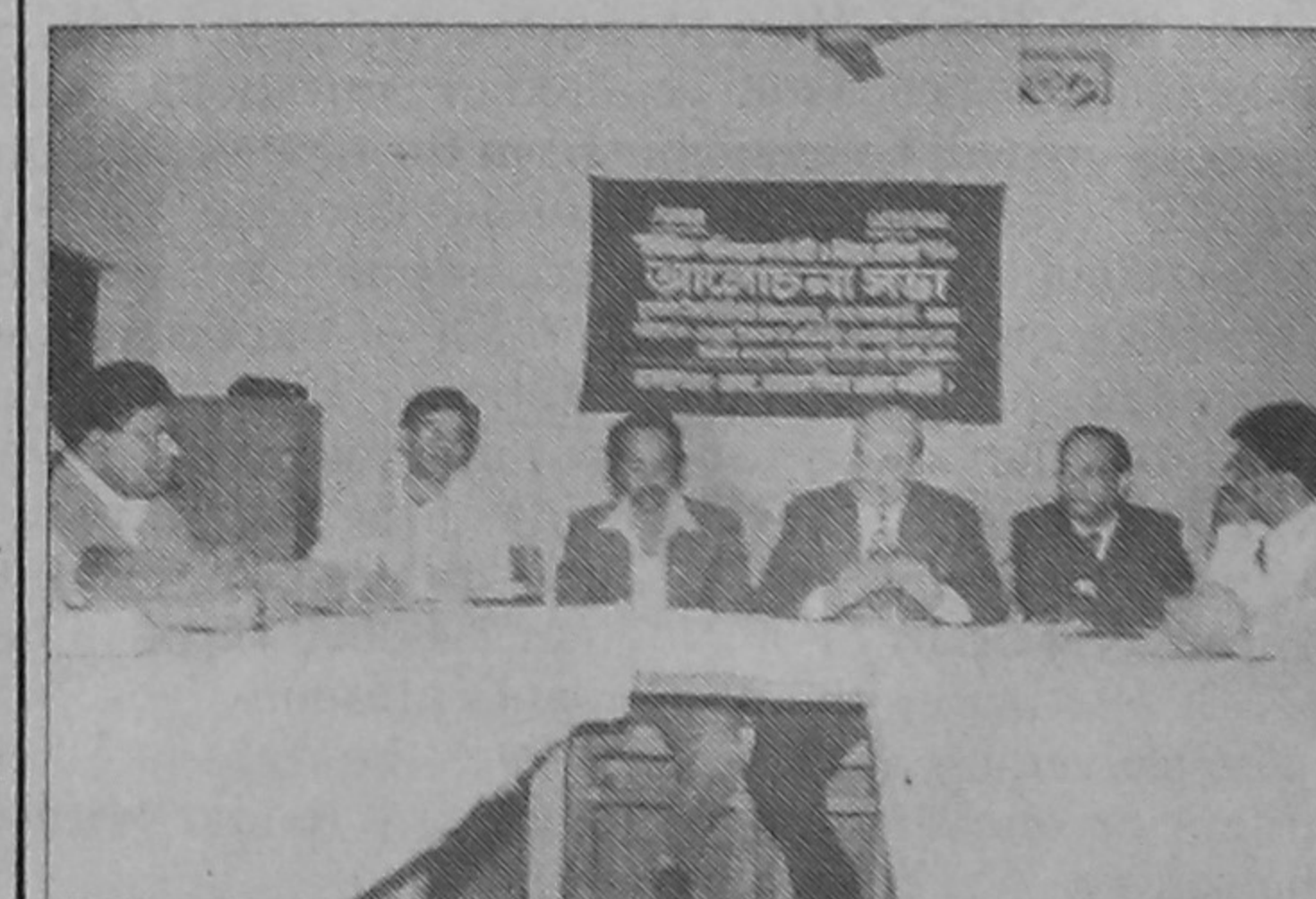
A discussion on functions and election of union parishad, organised by FEM, Mymensingh unit, was held recently in Mymensingh.

Coast Guard sources said smugglers left behind the boat, sensing the presence of coast guard during its routine patrol in the Bay of Bengal. Estimated value of the seized boat and cigarettes will be around Taka 12 lakh.