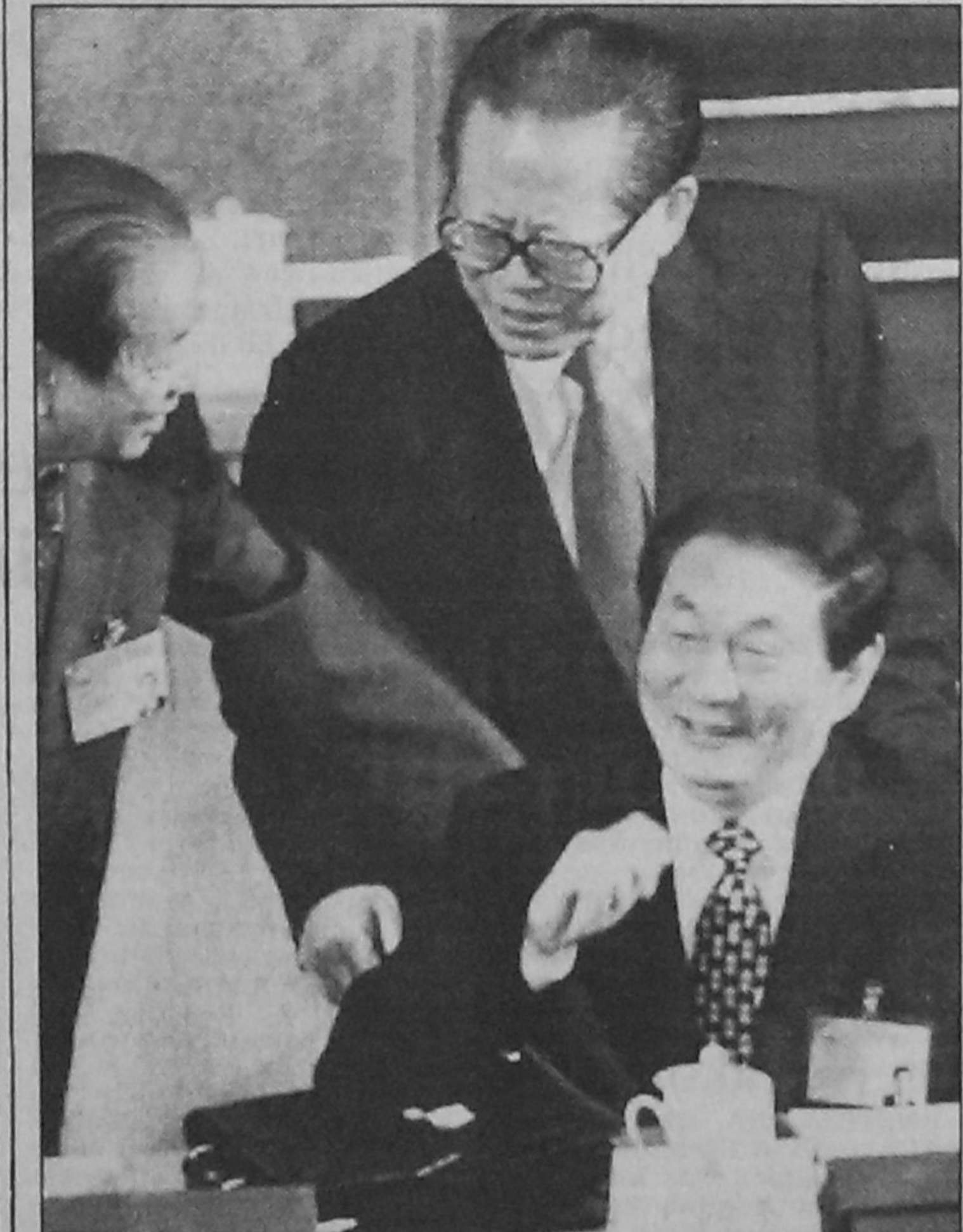
Chinese President Jiang Zemin (C) chats with Prime Minister Zhu Rongji (R) and Vice Premier Qian Qichen before voting on various work reports at the closing session of the National People's Congress, at the Great Hall of the People in Beijing yesterday.

"Those people who have made wrong calculations do not know the history of China and that the Chinese people will sacrifice their lives and use all their blood to defend China's sovereignty and dignity," he said.