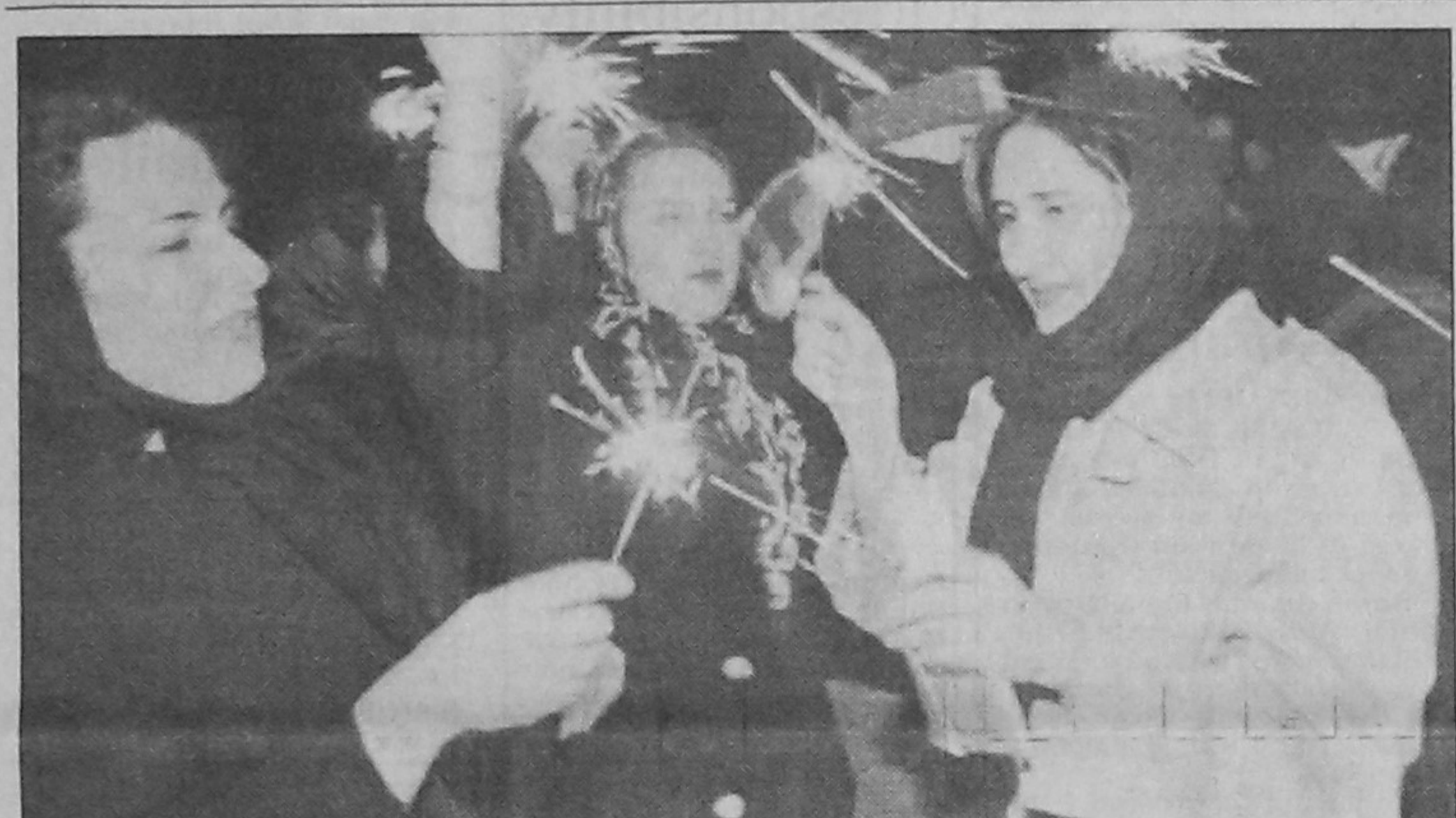
Iranian women wave firecrackers in Tehran late Tuesday during the Wednesday Fire, or Chaharshanbeh Soori, ritual held on the last Wednesday eve prior to Norooz, the Iranian new year that begins on March 20 to coincide with the first day of spring.