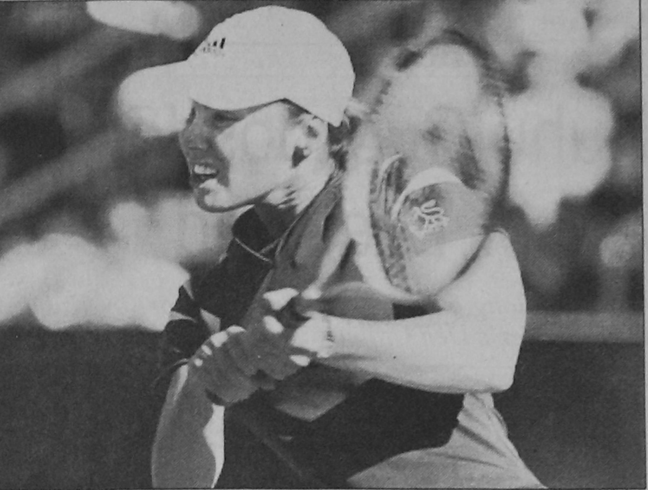
World No 1 Martina Hingis makes a backhand return against Barbara Schett of Austria during their Masters Series match on Monday.

He said Tergat had been included in the Kenyan team by virtue of his having won the national trials in Nairobi in February.