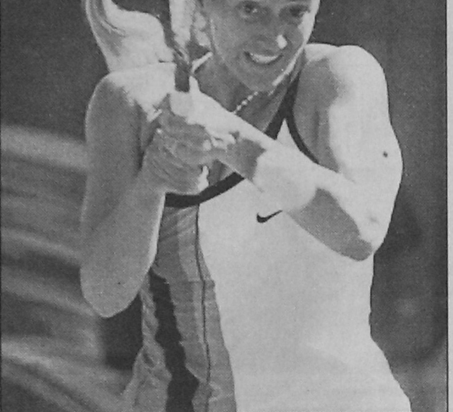
Mary Pierce of France playing against Elena Likhovtseva of Russia in the fourth round of the Masters Series on March 13.