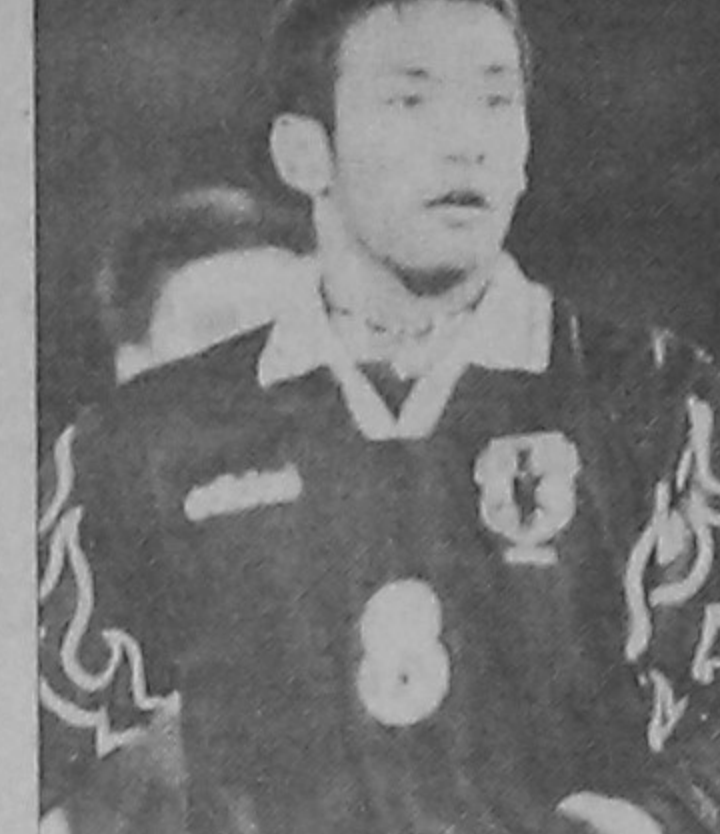
HIDETOSHI NAKATA squad along with Hiroshi Nanami and Spanish-based Shoji Jo.

Italian Serie A star and AS Roma record-signing Hidetoshi Nakata has been called up to the