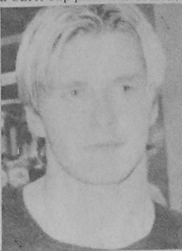
DAVID BECKHAM let alone another slot in the Champions League.

Now mid-table with just 33 points from 25 games, they are currently out of the running for a UEFA Cup place next season.