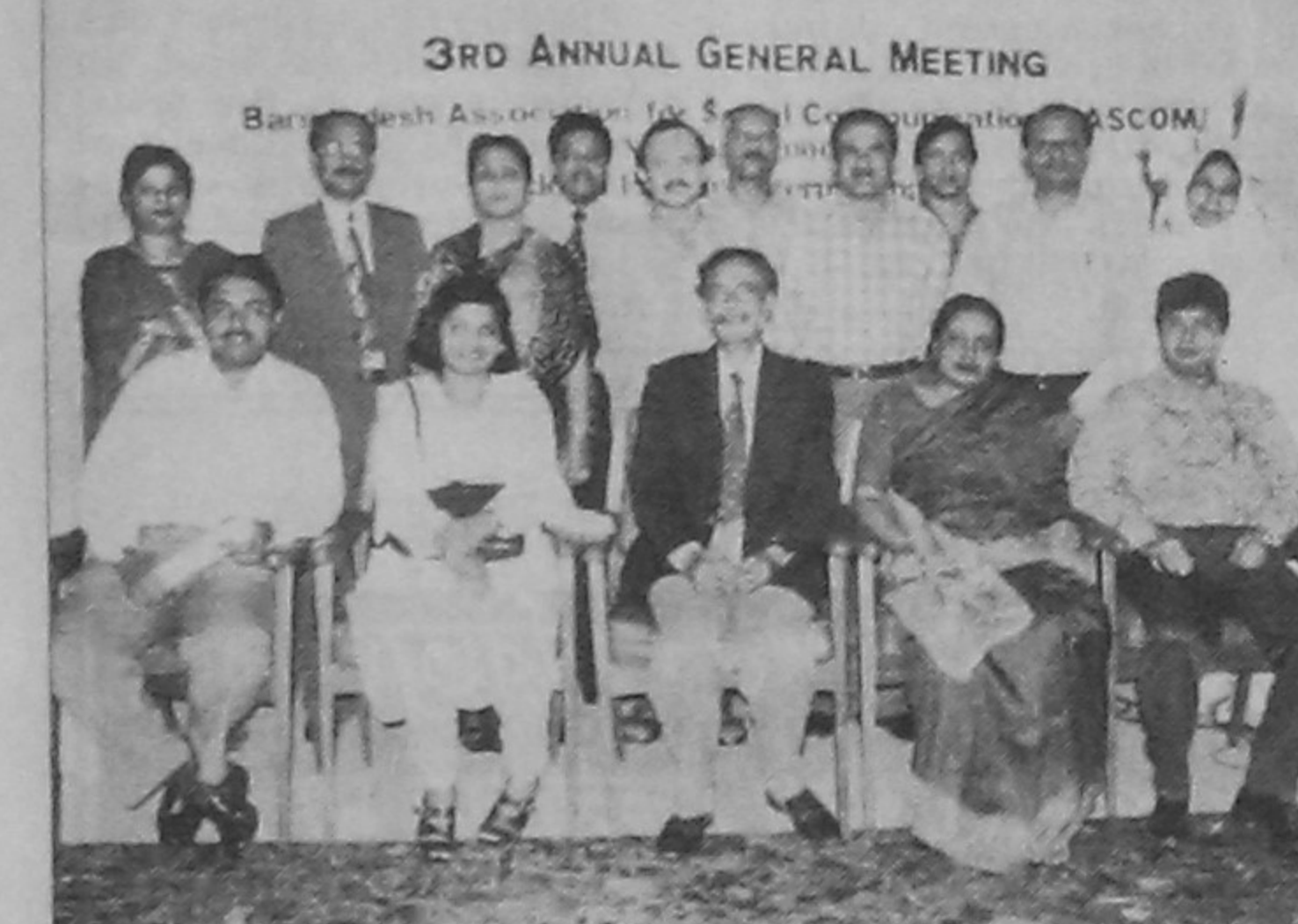
The newly-elected office-bearers of the Bangladesh Centre for Communications Programme (BCCP).

The day-long programme ended with an attractive raffle draw and colourful cultural function.