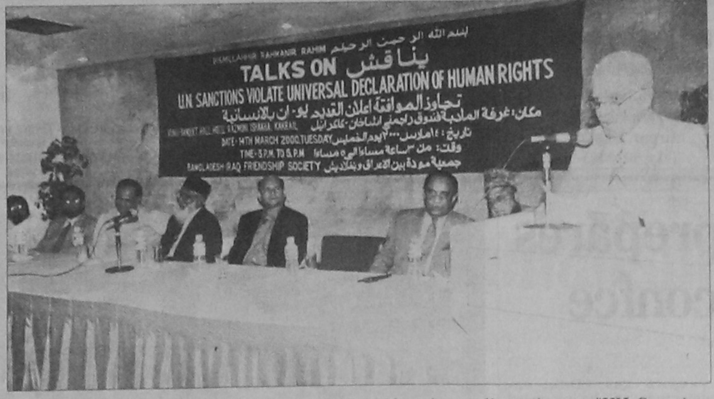
Nahid Ali Sultan, Charge d'Affaires of Iraq, addressing a discussion on "UN Sanctions Violate Universal Declaration of Human Rights" on Tuesday at a city hotel.