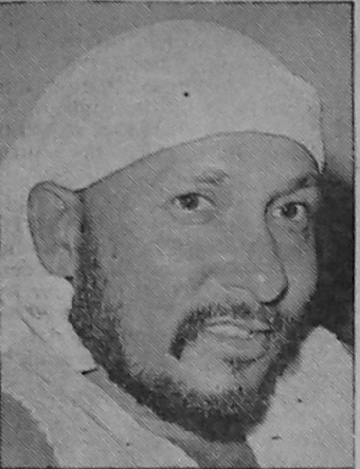
Syed Kirmani (Former Indian wicketkeeper) "An opener is a specialist batsman and having makeshift openers never helps."