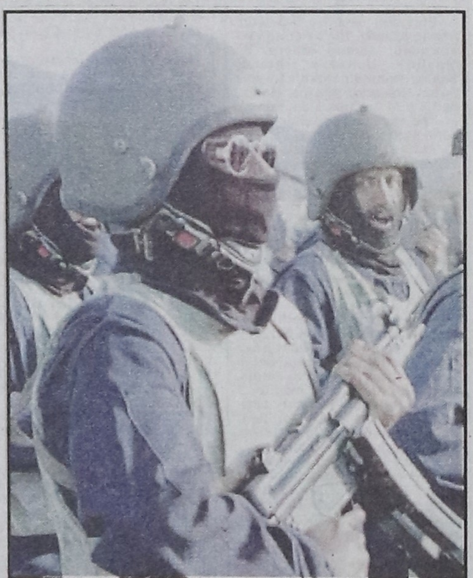
Saudi sappers from the Hajj special forces parade during a ceremony attended by Saudi Interior Minister Prince Nayef bin Abdel Aziz on Sunday in the holy city of Makkah. Prince Nayef said "the Saudi police are ready to handle any action that would disturb the flow of the pilgrimage" but added that he hoped no such action would take place.

roles. "If the public sector is not involved in an activity, there cannot be any corruption. This is a strong argument for privatisation of many state enterprises and for the private provision of infrastructure." He suggested three principles to curb opportunities for corruption. These are reduction of bureaucrats' discretion, searching for opportunities to provide alternative channels to citizens in their interaction with public officials and greater use of information technology for wider transparency. Temple said corruption in Bangladesh is 'quite pervasive'. He felt that PARC should put an anti-corruption programme at the top of its future agenda. "Corruption is impeding Bangladesh's efforts to reduce its massive poverty by reducing economic growth and lowering the achievement of social objectives. It destroys citizens' faith in their government. It deters the foreign and domestic investment which Bangladesh needs so badly." Referring to long delay in the award of contracts, Temple quoted a World Bank study that suggested, among other things, creation of an independent division for public procurement policy, passage of a public procurement law and publication of award of contracts involving more than 20,000 US dollars.