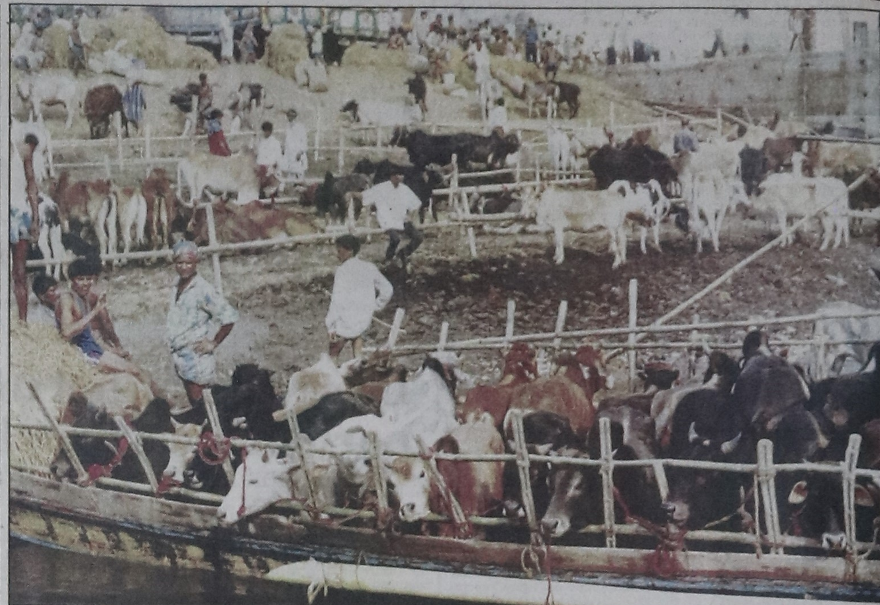
Sacrificial animals have started arriving in the city through Mill Barrack after travelling by river.