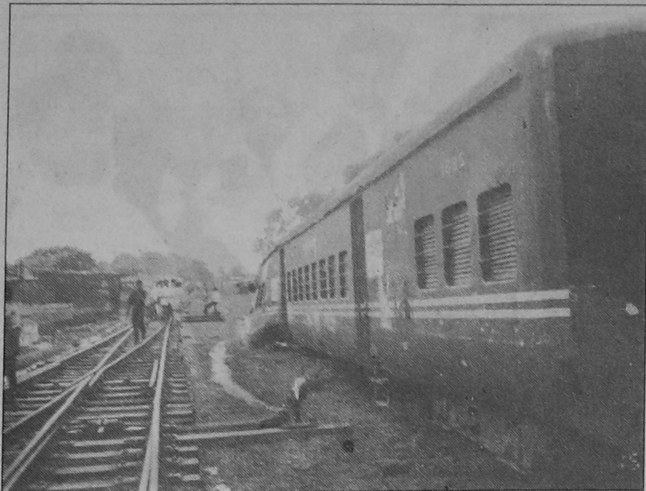
Sheer indifference of Rly authorities Two compartments of inter-city Ekota Express train derailed in an accident near the home signal of Jamalpur Railway Station in 1991 causing a great loss. Since then the Railway authorities took no steps to salvage and shift the compartments to any railway workshop. This has created problems in plying of trains, as a track remains totally useless. This results in much inconvenience to passengers, as they have to wait for a longer period due to pressure of trains on the remaining tracks.