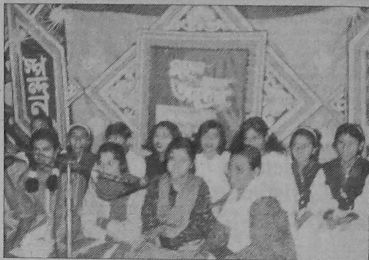
Juvenile artistes render song at a function organised on the occasion of International Mother Language Day in Gaibandha.

Officials said dealers of the northern region have also stopped lifting urea from Santahar buffer stock from March 1 over a dispute with the authorities, worsening the fertiliser crisis. Taking advantage of the situation, a section of unscrupulous traders have raised the urea price, forcing the growers to pay Tk 15-20 more per bag of urea. When asked the dealers said they stopped lifting urea as the authorities turned down their demand for coarse granule of urea, which has better demand among the farmers. Meanwhile, Deputy Director of the Department of Agriculture Extension and president of Fertiliser Dealers' Association in the northern region visited Santahar buffer stock and had a meeting with the officials on Thursday. But the meeting ended inconclusively.