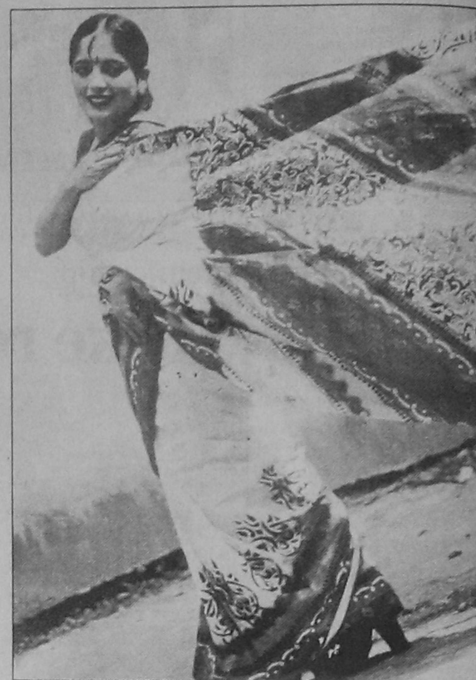
The Sarees of Design Rots are colourful

The exhibition ended yesterday but Designer Rots' items are available at their outlet at House No 1/9, Lalmatia Block D.