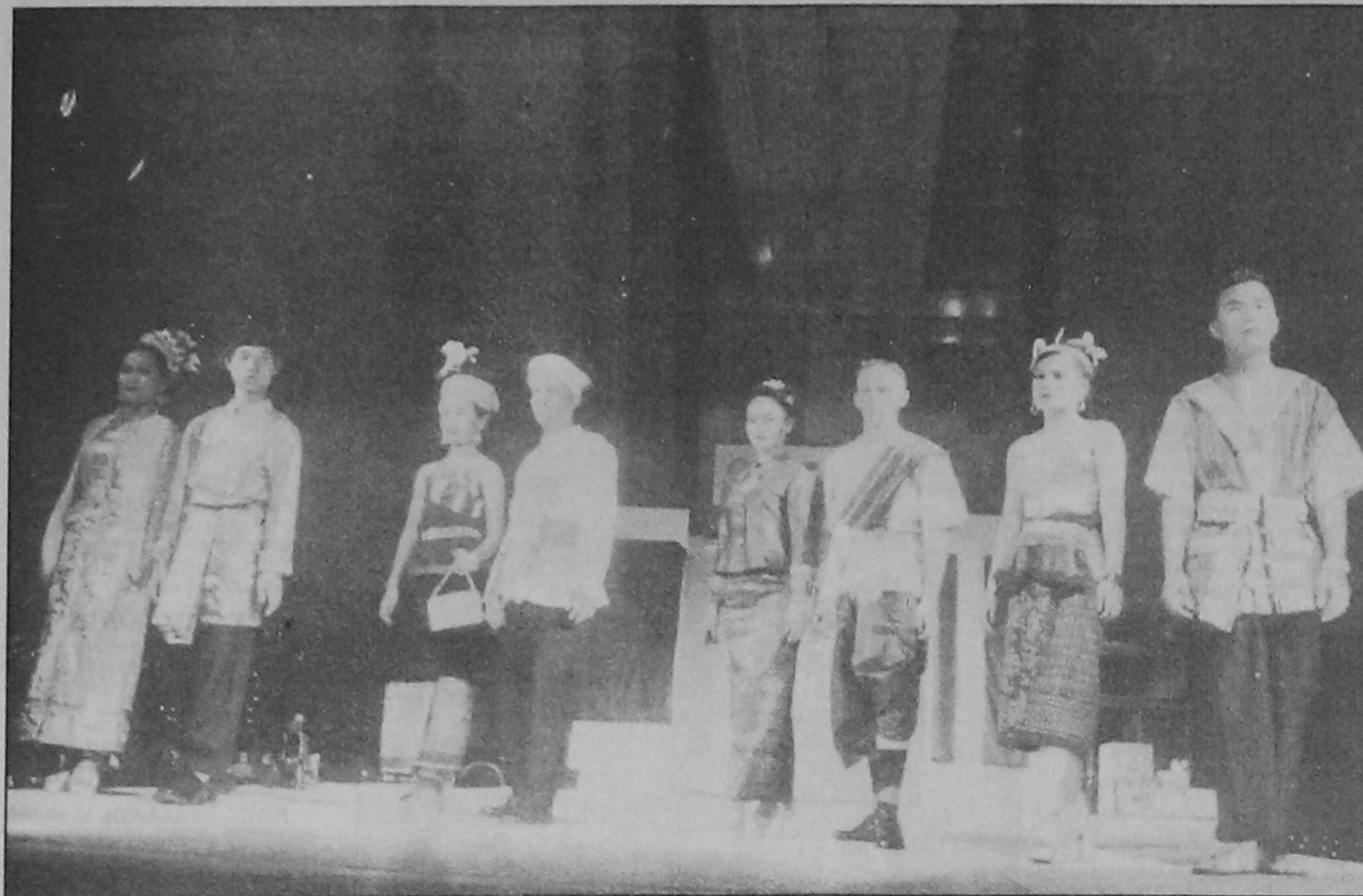
Models presenting traditional dresses from 4 regions of Thailand at the Pan Pacific Sonargaon Hotel

Thai Fabric and Fashion Show 2000 held at the Pan Pacific Sonargaon Hotel