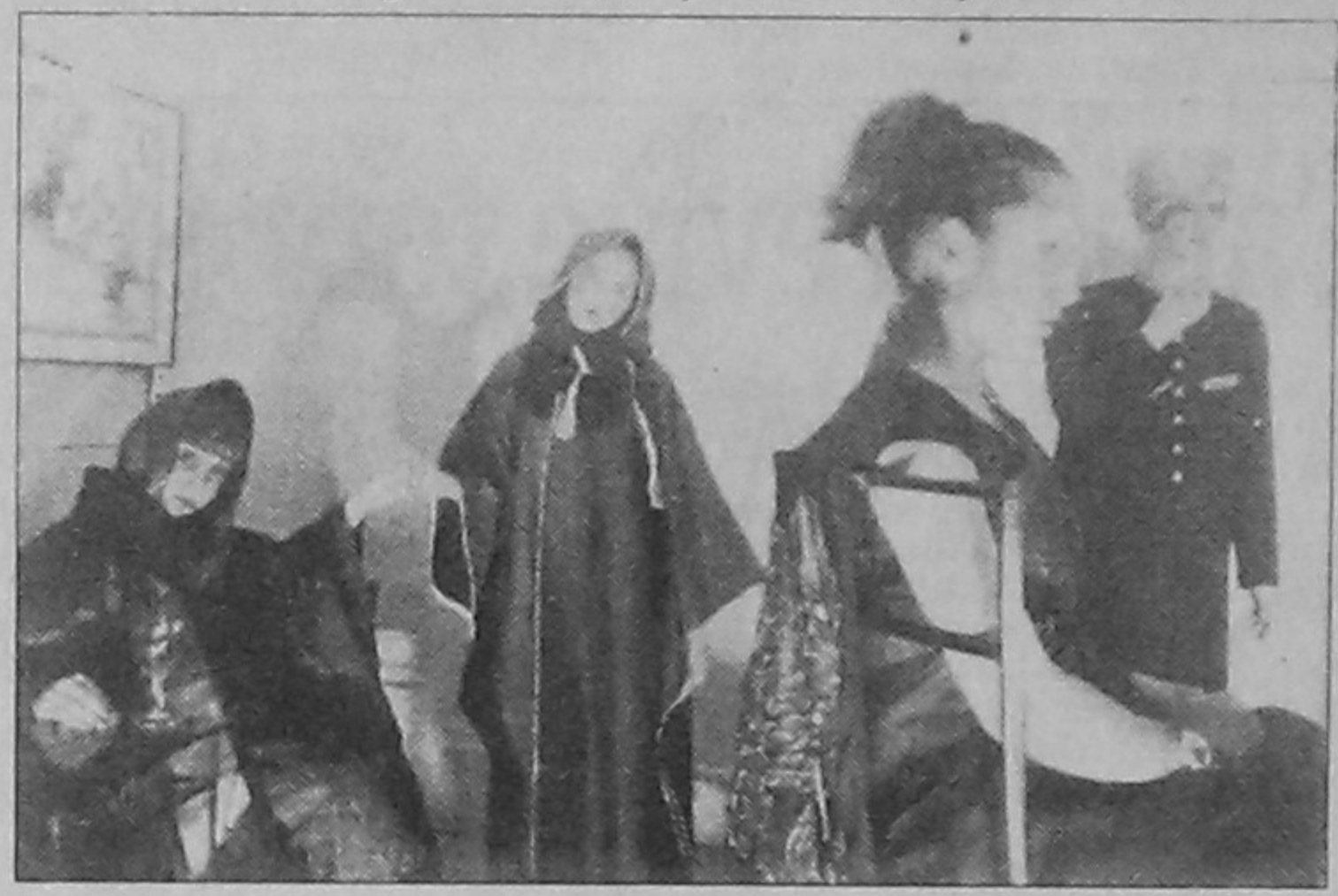
Live models added to the innovative presentation of Kuhu's creation at the DD Gallery - Star Photo by Zahedul Khan