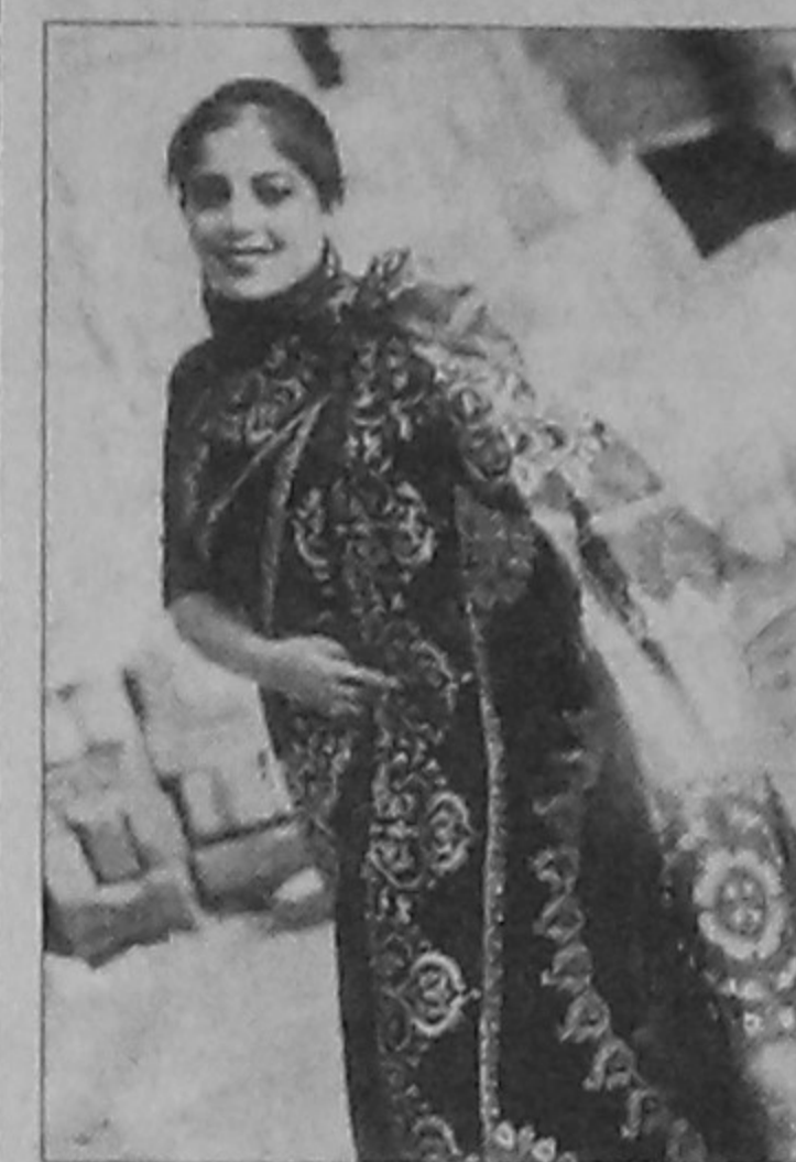
A model wears an eye-catching black saree

THE end of winter and the coming of Eid-ul-Azha is a time for fashion designers to brush up their