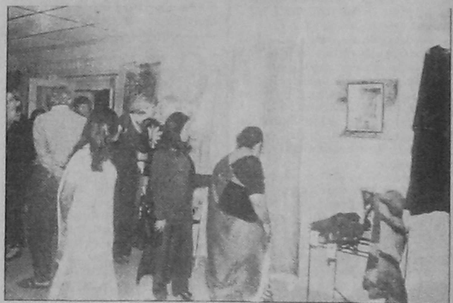
Kuhu's collection at Designer's Den Gallery attracted large crowd