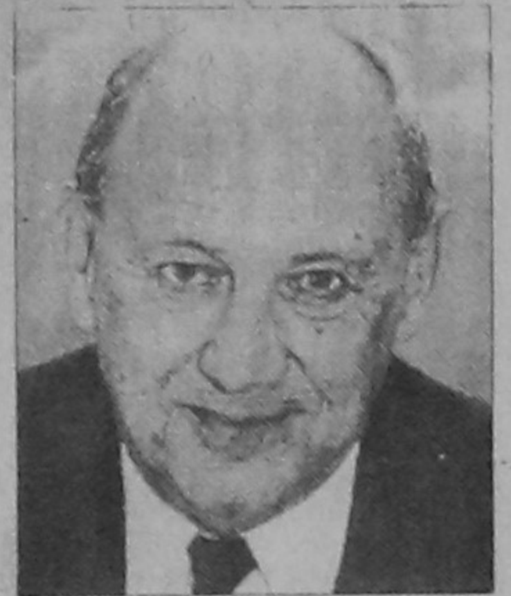
Raman Subba Row (ICC match referee)

"That no-ball I'm afraid was a very sad error of judgement at the time." On the no-ball called in the final over of the first one-day international between India and South Africa in Cochin.