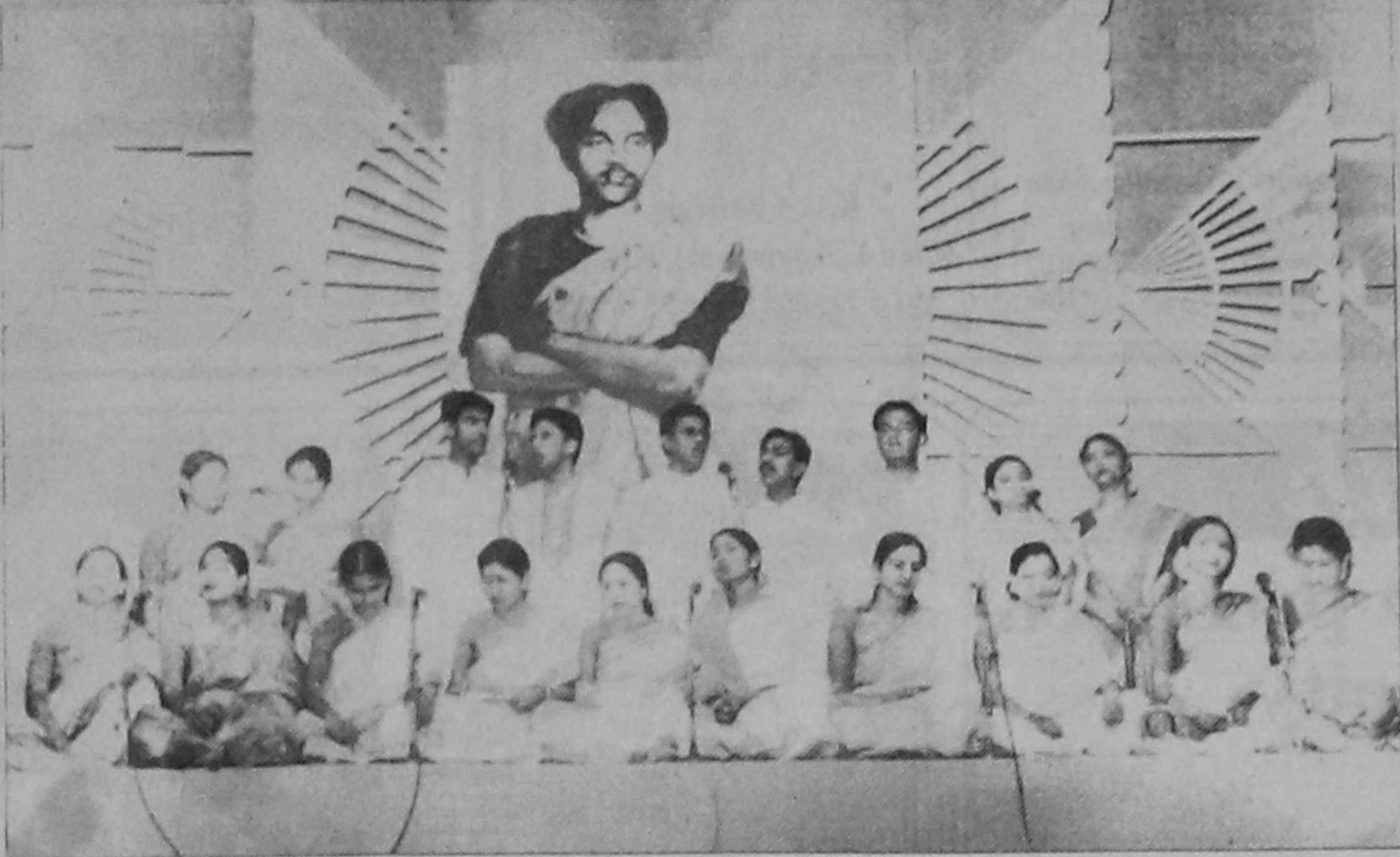
Artists of Chhayanaut presenting a chorus number at the Nazrul Birth Centenary national convention held at the National Museum auditorium in the city yesterday.