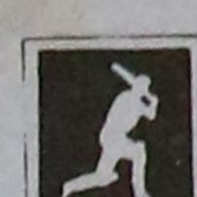
JOHANNESBURG, Mar 8: Paceman Allan Donald is not too disappointed he fell short of the magical 300-Test wicket mark during South Africa's successful tour of India, reports Reuters.

"I said it wasn't going to be the end of the world if I didn't achieve it. I was very happy with my performance and I always knew 10 wickets was going to be a very difficult task in two Test matches on those wickets," he said on his return from India.