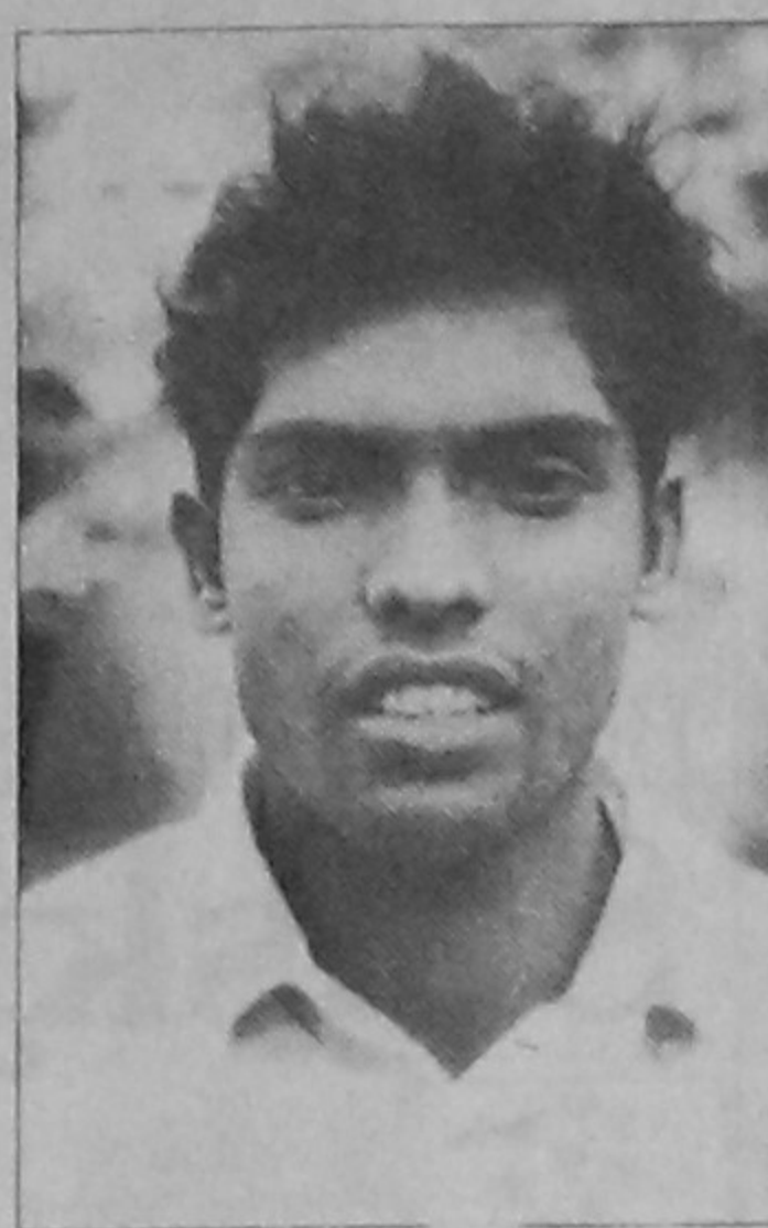
NASIRUL ... 90

Put into bat, Mohammedan suffered an early blow when opener Rashedul Haque edged right-arm pacer Rezwanul Haque to the safe hands of wicketkeeper Nuruzzaman in