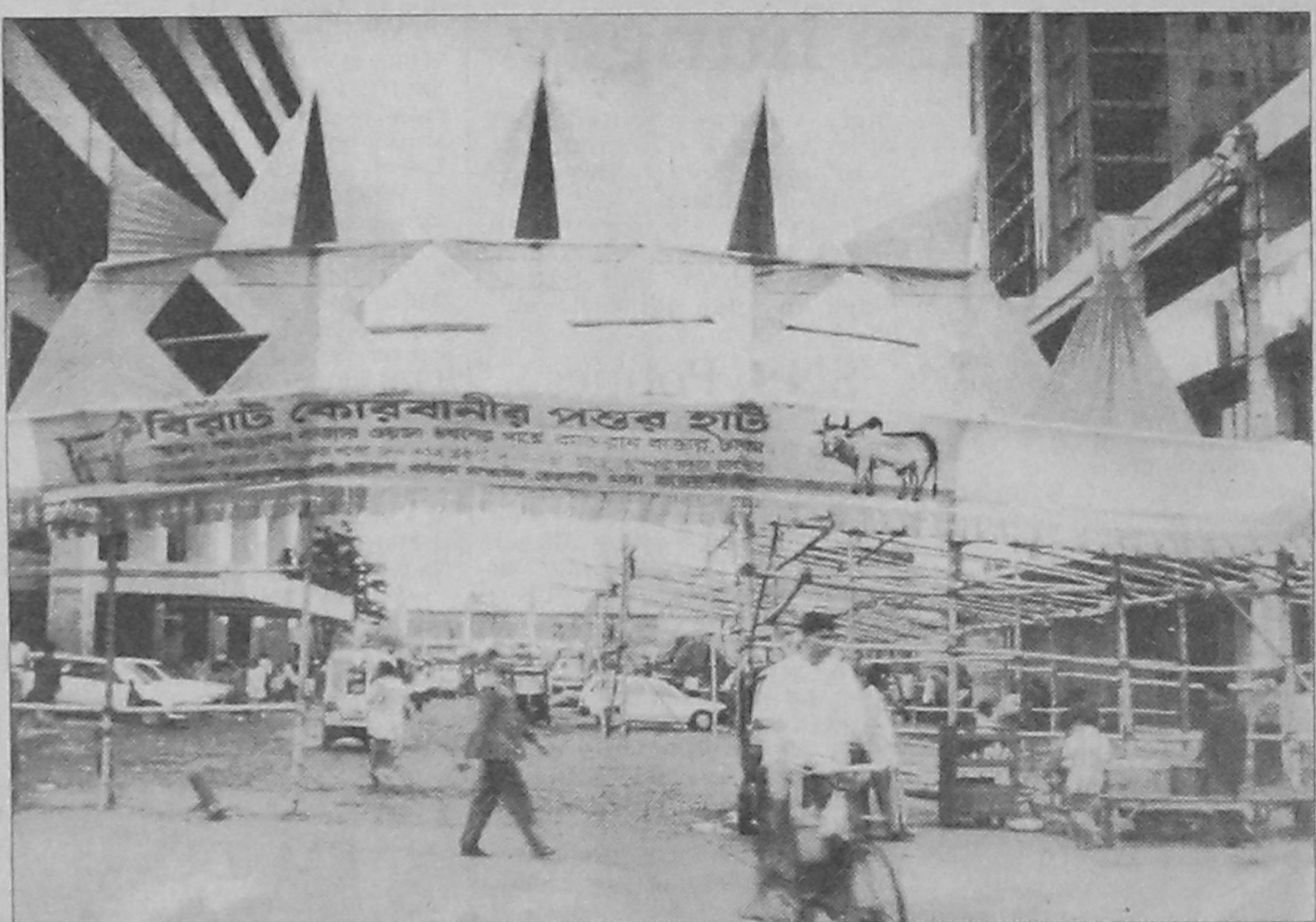
Dhaka City Corporation (DCC) has leased a road in front of the WASA building at Karwan Bazar for Eid cattle market, defying its own ban on obstructing traffic on the city roads.