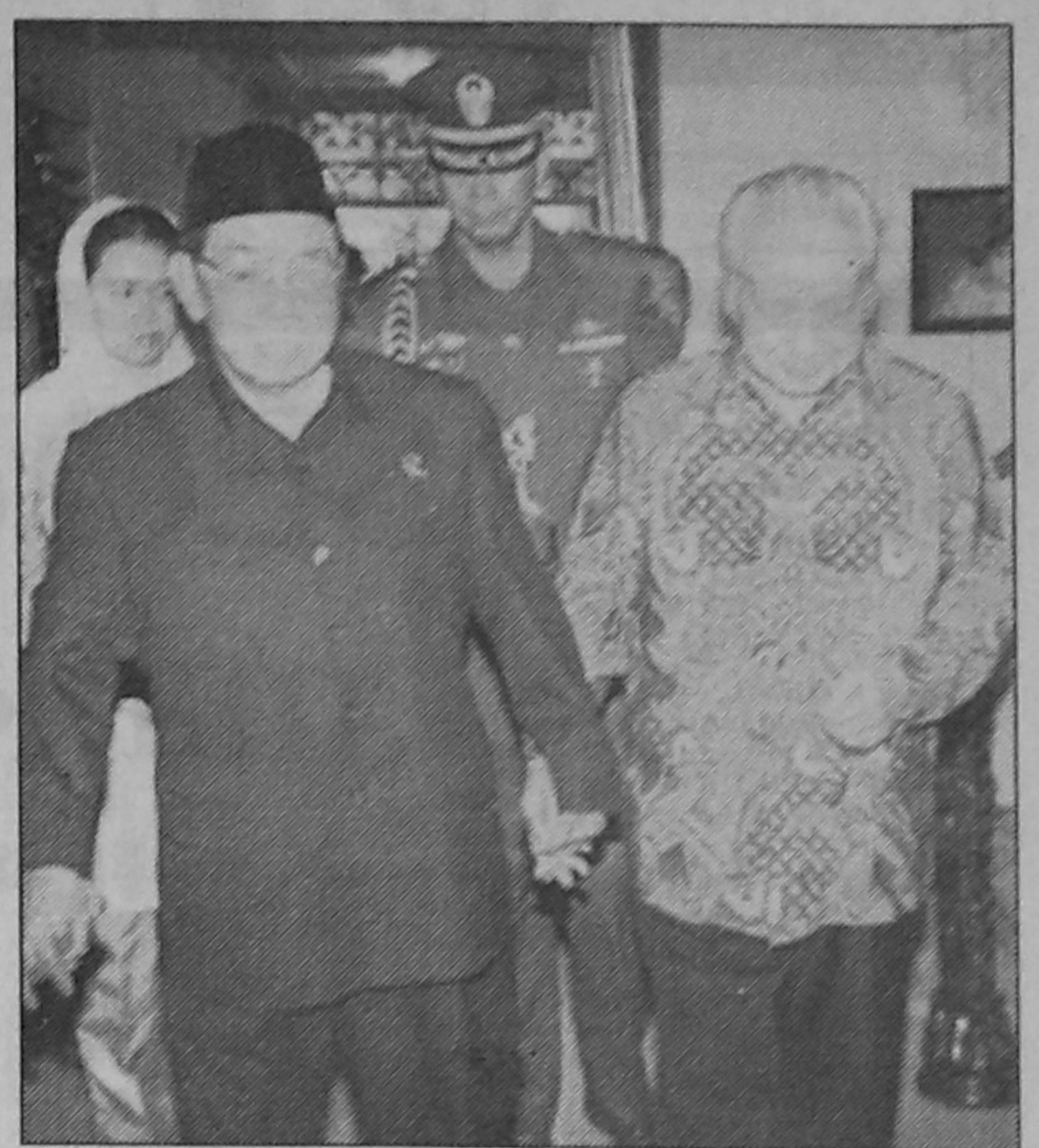
Former Indonesian president Suharto (R) and President Abdurrahman Wahid hold hands as they walk to Suharto's living room for talks at his residence in Jakarta yesterday. Suharto personally welcomed Wahid when he arrived for his first meeting with him since assuming the presidency in October, and saw his guest off about an hour later.

And Thailand marked the day with a five-point demand, including declaring March 8 a public holiday, childcare funding, a reduction of workplace hazards, implementation of employment insurance and promoting female workers in policy-making.