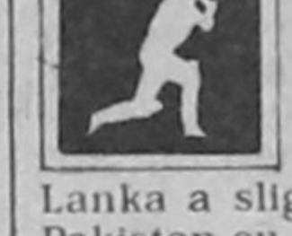
PESHAWAR, Mar 7 (AFP): Off-spinner Muralitharan grabbed four quick wickets to give Sri Lanka a slight advantage over Pakistan on the third day of the second cricket Test here Tuesday.

due to stomach and back problems, dismissed Sanath Jayasuriya (6) and Mahela Jayawardene (10) to restrict Sri Lanka's progress. The Sri Lankan captain looked dangerous when he hit Shoaib Akhtar for a six to point but was trapped leg before. Jayaswardene accompanied Marvan Atapattu in a second wicket stand of 62. Atapattu made 29 with four fours before top edging Arshad Khan to Aamir Sohail at short mid-wicket. Arnold punished the Pakistani bowlers to all parts of the field. He completed his fifty in 165 minutes hitting eight boundaries. In Pakistan's innings captain Saeed Anwar hit a fine 74 while Inzamam-ul-Haq was left stranded at 58 not out as the home team lost seven wickets in the second session for just 46 runs. Pakistan conceded a lead of 69 runs. Pakistan were well placed for a lead at lunch with 153-3