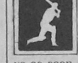
PESHAWAR, Mar 7 (AFP): Ousted Pakistan cricket coach Intikhab Alam said Tuesday he would resign as soon as the current Test against Sri Lanka was finished and lashed out at the way authorities handled his dismissal.