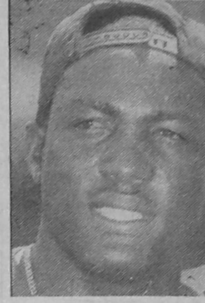
SACHIN TENDULKAR , arguably the best in the world, has gifted partners like Pakistan captain Saeed Anwar and Sanath Jayasuriya, the back-in-form present Sri Lankan skipper.

announced the team in New Delhi early yesterday. The players were picked by a panel of five judges--ex-Test stars Sunil Gavaskar, Tony Greig, Ian Chappell, Asif Iqbal and Mike Procter. Former Indian all-rounder Ravi Shastri was the moderator of the panel. Despite the prospect of a fascinating encounter, one sour note in the selection was the ab-