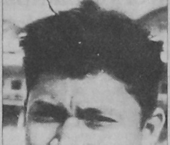
BIKASH ... 3 for 27 dred if you take the experience and exposure in consideration". See page 15