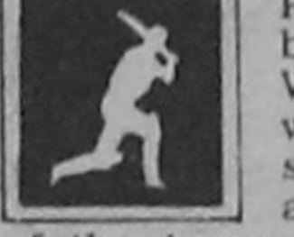
Wasim Akram will lead a star-studded Asian XI against the might of the impressively lined-up Rest of the World XI to be

announced the team in New Delhi early yesterday. The players were picked by a panel of five judges--ex-Test stars Sunil Gavaskar, Tony Greig, Ian Chappell, Asif Iqbal and Mike Procter. Former Indian all-rounder Ravi Shastri was the moderator of the panel. Despite the prospect of a fascinating encounter, one sour note in the selection was the ab-