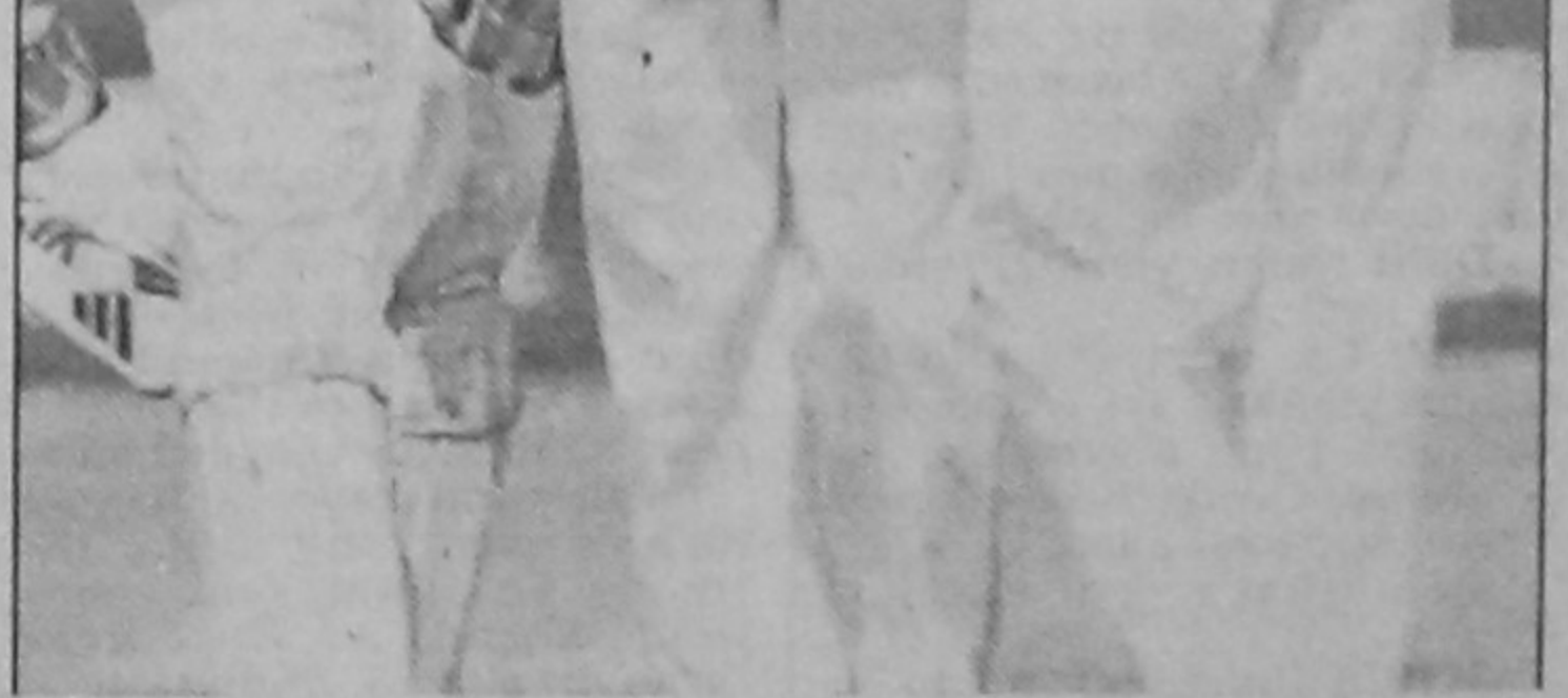
IN HIS ELEMENTS: Pakistan pace superstar Shoaib Akhtar (C) being congratulated by teammates after getting one of his five Sri Lankans wickets at Peshawar yesterday.