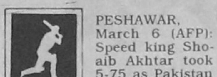
PESHAWAR, March 6 (AFP): Speed king Shoaib Akhtar took 5-75 as Pakistan gained the upper hand on the second day of the second cricket Test against Sri Lanka here Monday.

Pakistan, having lost their last four Tests, finished the day at 67-1 with skipper Saad Anwar on 37 and Yousef Youhana on three.