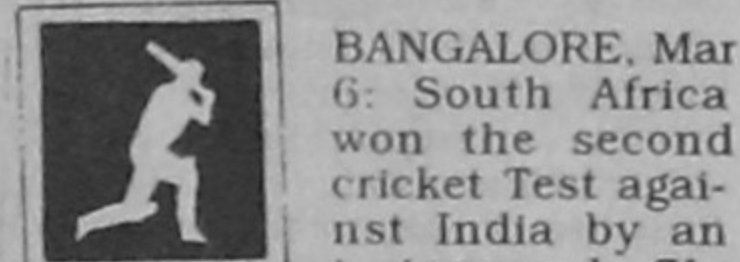
BOJE ... m-o-m

BANGALORE, Mar 6: South Africa won the second cricket Test against India by an innings and 71 runs here Monday, to take the series 2-0 and end India's 13-year unbeaten home record, reports AFP.