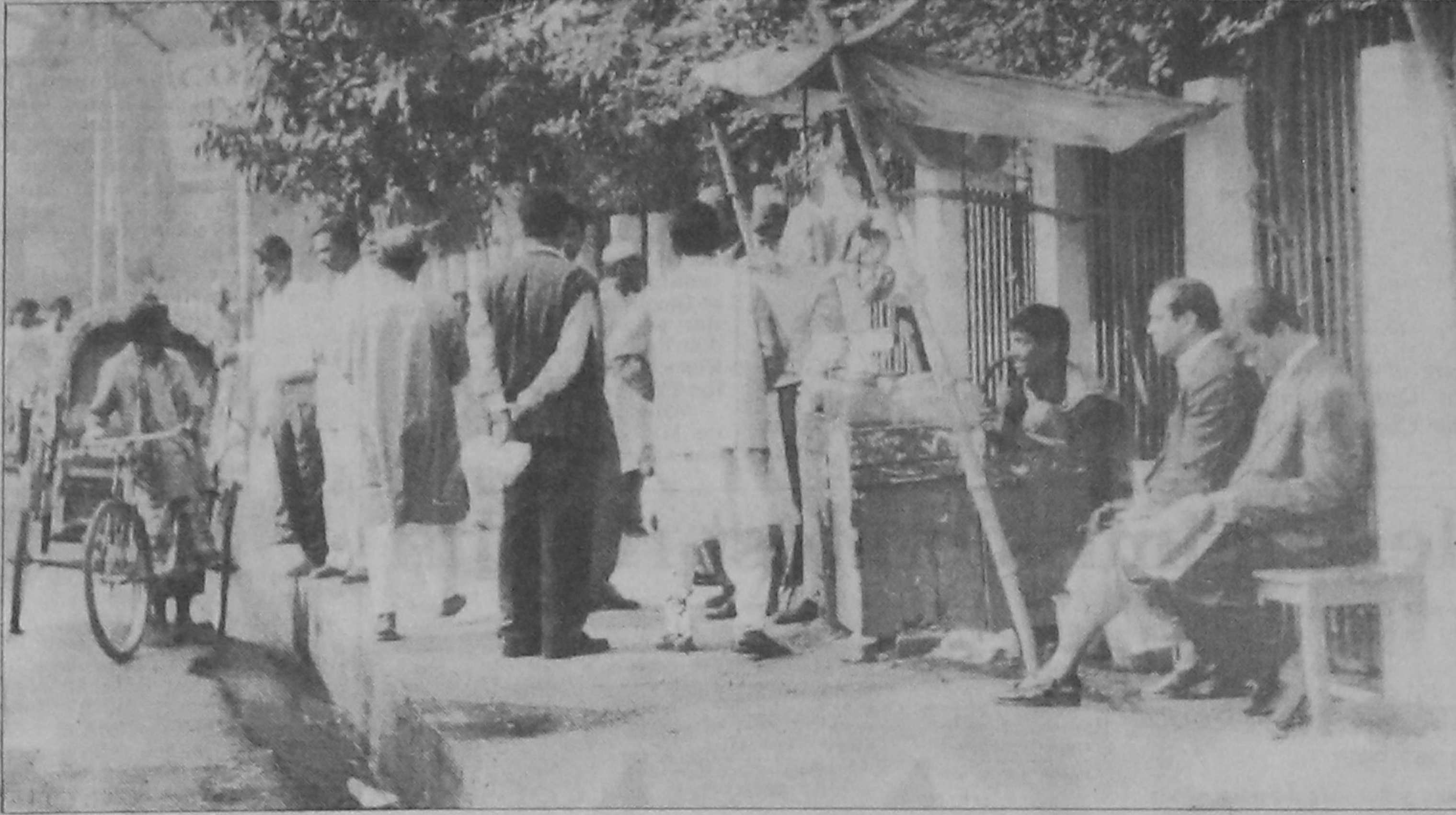
Visitors often stop for a couple of tea at a shop on the sidewalk on Minto Road. They call on ministers at their official residences for different business.

Published by the Editor from Transcom Ltd, 229, Tejgaon Industrial Area, Dhaka-1208 on behalf of Mediaworld Ltd., 52 Motijheel C.A., Dhaka-1000. Editorial, News & Commercial Offices: 19 Karwan Bazar, Dhaka-1215. Telephone Numbers: 8124944, 8124955, 8124966. Fax: 8125155. GPO Box No: 3257. Cable: DAILYSTAR, DHAKA. Internet edition address: http://www.dailystarnews.com and Email address: dstar@bangla.net