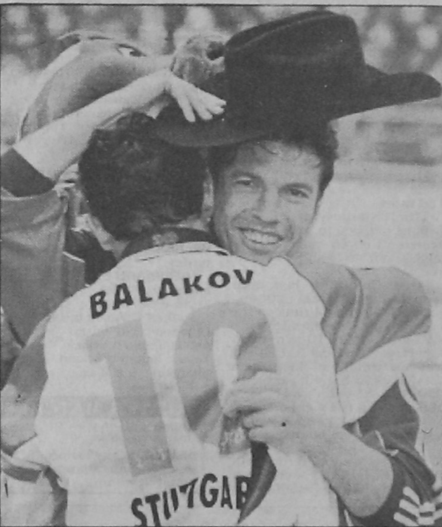
GOOD LUCK IN COWBOY COUNTRY! VfB Stuttgart captain and Bulgarian international Krassimir Balakov embraces Bayern Munich superstar Lothar Matthaeus after presenting him with a cowboy hat before the start of their Bundesliga encounter.

He joins veteran German star Lothar Matthaeus in joining the MetroStars, who have been consistent underachievers since the MSL began.