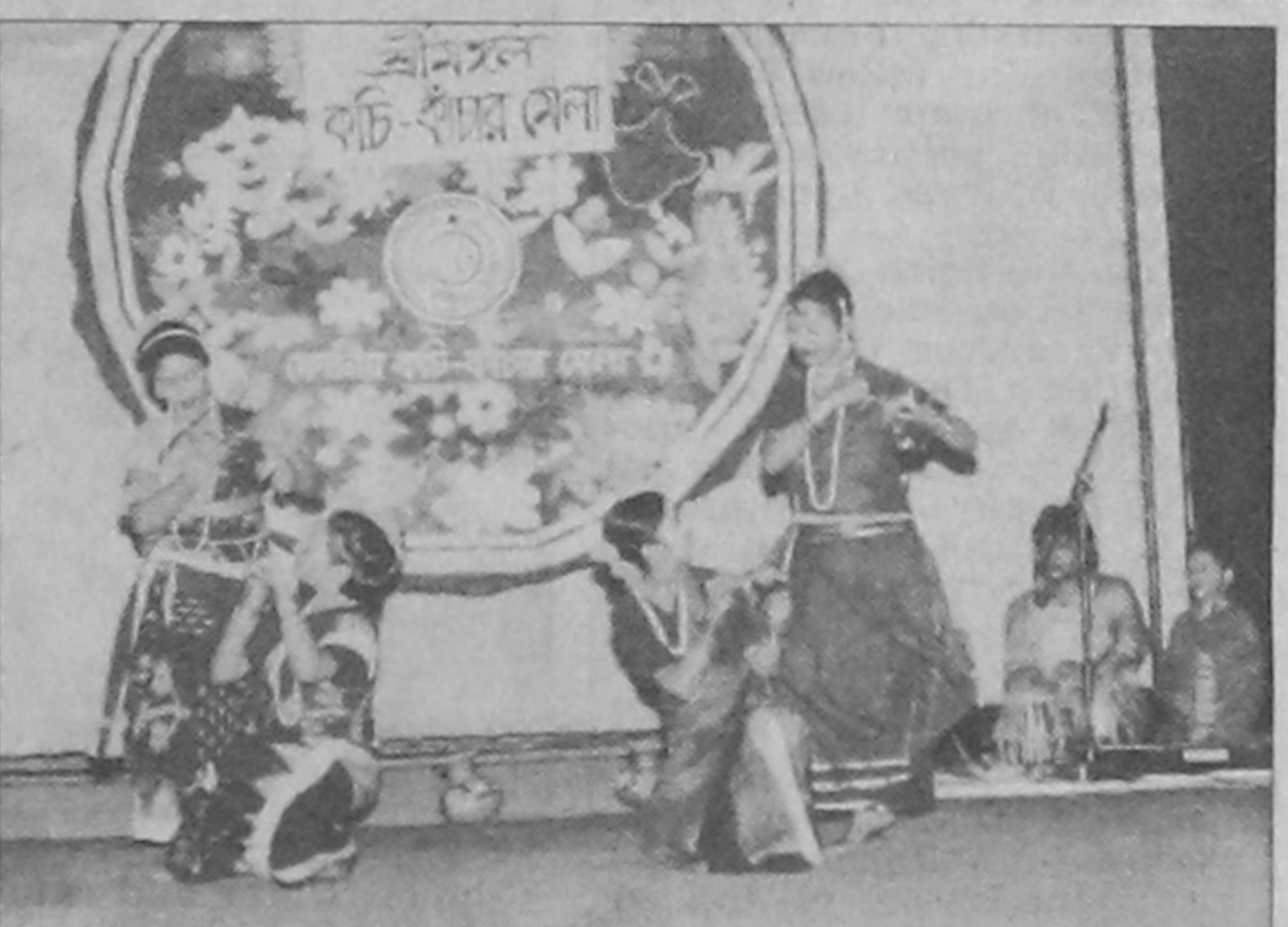
Artistes of Srimongal Mela performing the traditional 'Dhamyil' dance at a Kendriya Kachi Kanchar Mela, programme in the city yesterday.