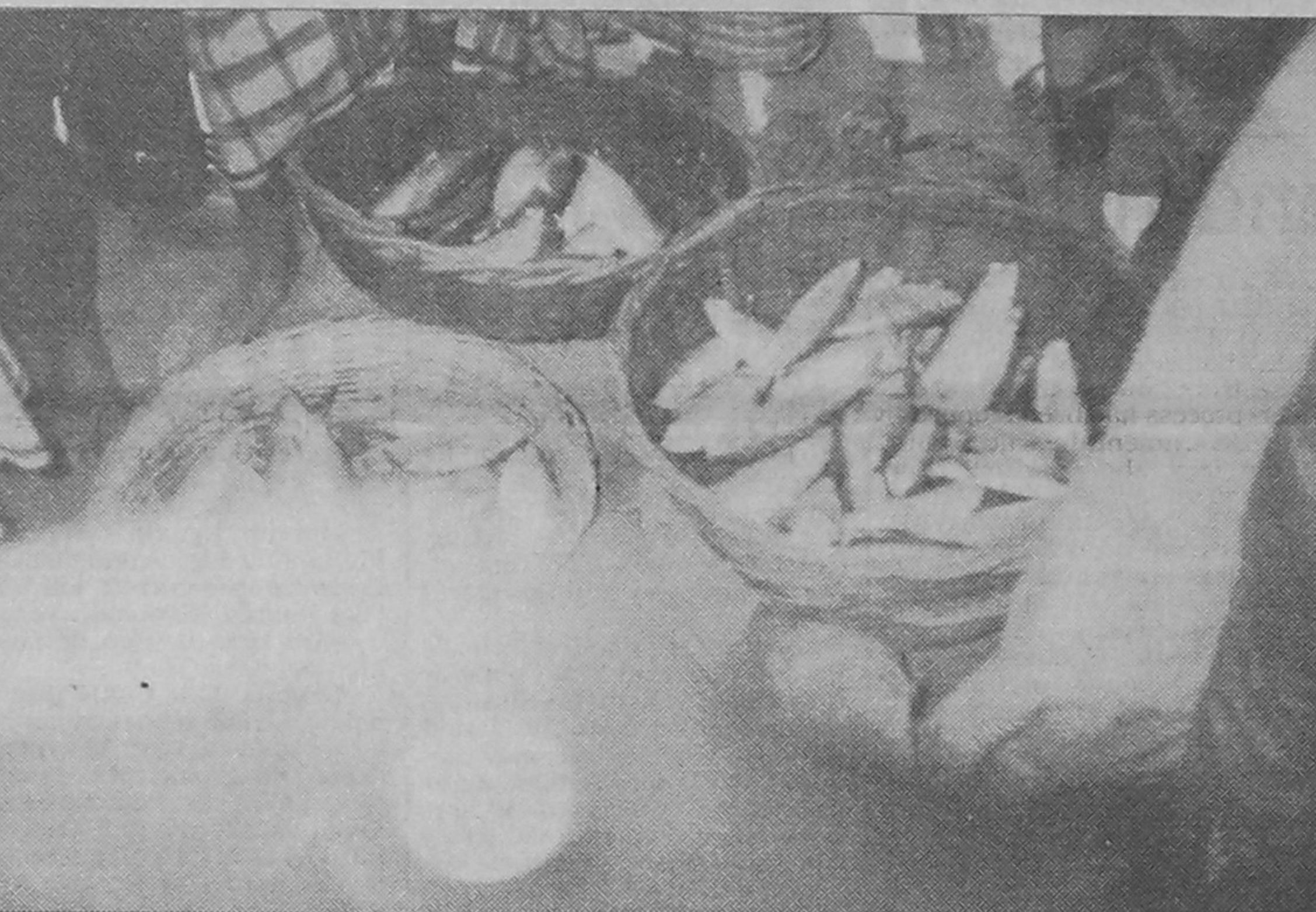
Hilsha fries on sale in a fish market in Sirajganj town. The picture was taken last week.

But pisciculturists said this treatment alone cannot control the disease. They demanded some effective measures to control the disease. They also demanded that pisciculturists should be given special training and effective medicines should be supplied to combat the disease.