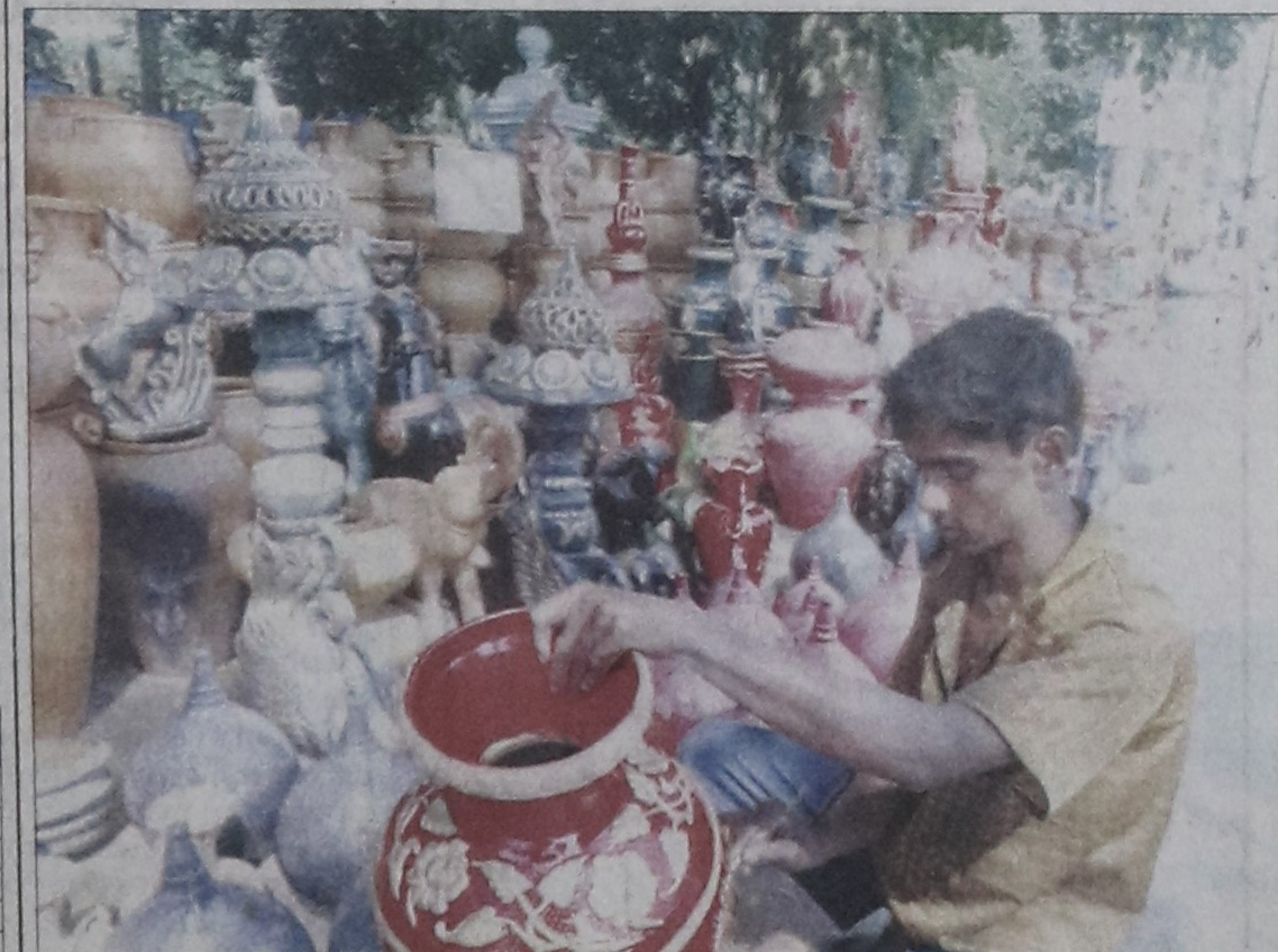
A potter paints his clay items in front of the Shishu Academy in the city yesterday.