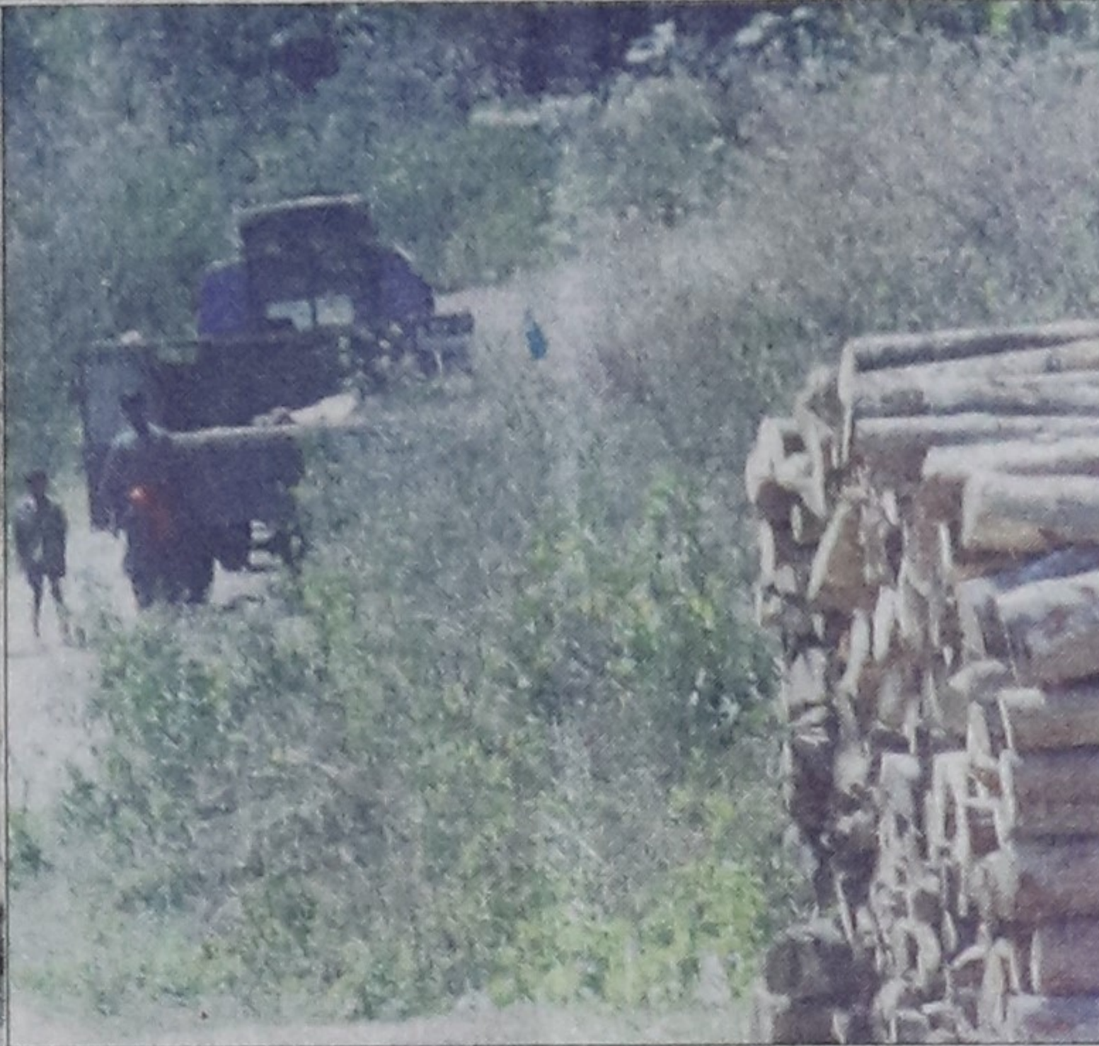
A truck waits to be loaded with the neatly stacked timber on Panchari-Tabalchari road (right) and logs being seasoned before processing at an illegal saw mill, one of the many that mushroomed over couple of years along the Khagrachari-Panchari road.