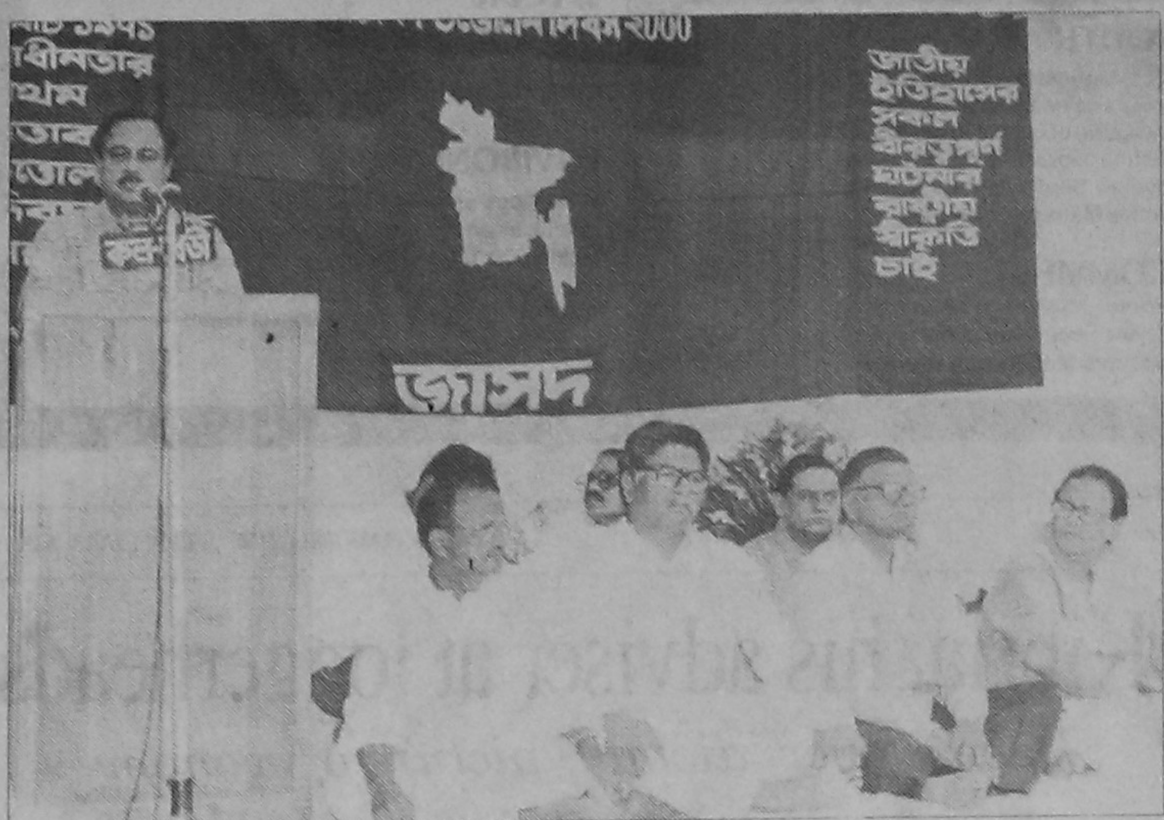
A S M Abdur Rab, Minister for Fisheries and Livestock and president, Jatiya Samajtantrik Dal (JSD) speaking at a discussion meeting at Ramna Batamul to mark the anniversary of the first hoisting of national flag yesterday.

Admission from VII to A-level in regular coaching. BOSON TUTORIAL, 130 Lake Circus, Kalabagan 326515. 9353567/229. C-194