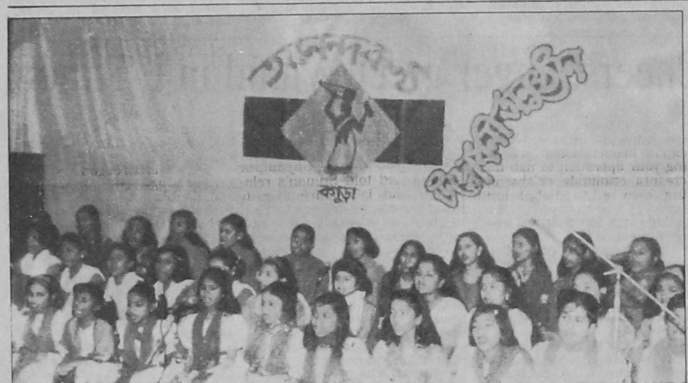
A new cultural organisation named Ananda Kantha was floated through a function at Bogra Zilla Parishad auditorium recently. Photo shows artistes of the new organisation rendering songs on the occasion.

Property and valuables worth Taka 33 lakh were gutted in Rangamati and Habiganj in two fire incidents recently, reports agency. In Rangamati, ten houses were gutted in a devastating fire at DSB colony in Sadar thana on Sunday. Witnesses said the flame originated from a house at night and soon raged through the adjacent houses, burning down property worth about Tk eight lakh. Firefighters with the help of local people put out the blaze. Meanwhile, the municipality authorities have distributed relief materials among the fire-affected families. In Habiganj, six shops were gutted in a fire at Tinkona Pukur Parh in the town on Wednesday night destroying valuables worth about Tk 25 lakh. Witnesses said the fire originated from an electric short circuit at about 12:45 am. Firefighters with the help of local people put out the flame.