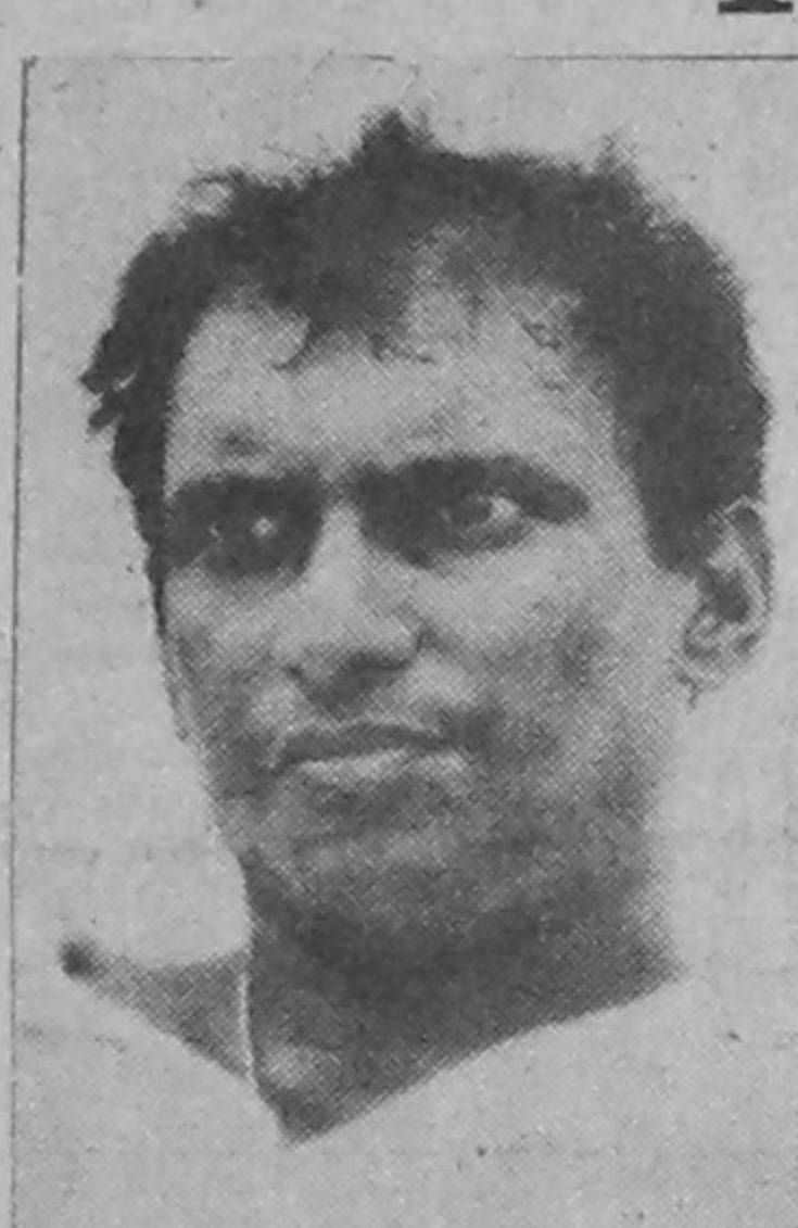
ARAVINDA DE SILVA

"My hundreds against the likes of Imran Khan and Abdul Qadir in 1986 were my best but