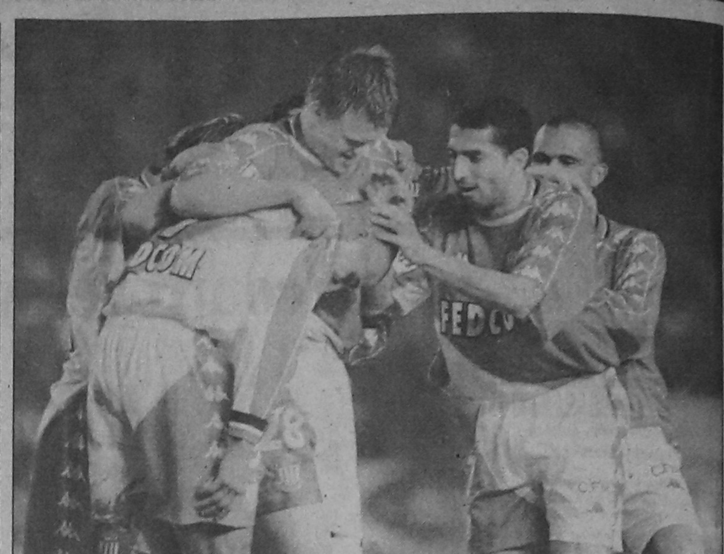
Monaco striker David Trezeguet (L) is the toast of his teammates after scoring in a French First Division match in Meinau on February 27.

Ronaldo has said that he hopes to be playing in the second qualifier against Ecuador on April 25-26 in Sao