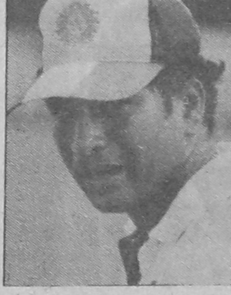
TENDULKAR ... m-o-m

Cronje described the win as one of the finest by his team. "This is a big one for us," he said. "It's not easy to win in Indian conditions, but the bowlers did their job well and the batsmen did not allow the