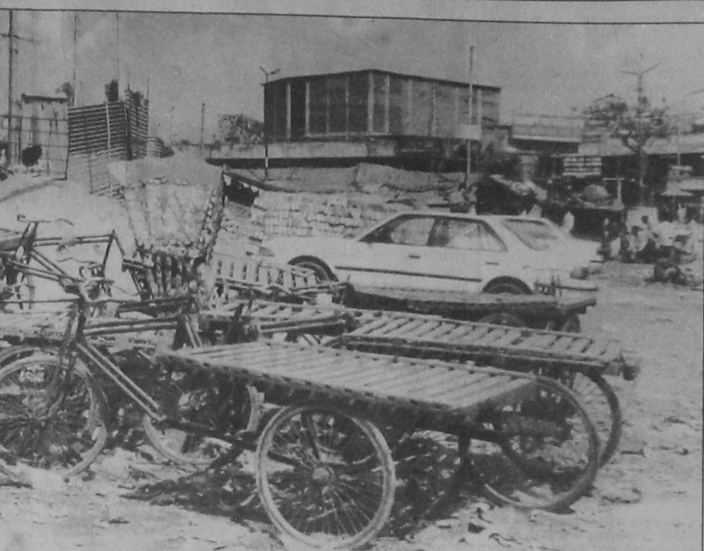
Unauthorised parking of rickshaw van and stacks of rubbish in front of The Daily Star office has made the place a mess.

An advance team of White House officials will arrive in Dhaka on March 8 or 9 to put the finishing touches on US President Bill Clinton's visit to Bangladesh. US diplomatic sources told UNB the advance team would stay until Clinton's arrival on March 20. The team comprised of officials from different departments of the US administration, including security and secret services, is expected to finalize Clinton's itinerary in consultation with the Bangladesh government. They will examine sites Clinton will visit and discuss security matters, prepare schedules and an agenda of the official talks between Dhaka and Washington. However, the sources would not discuss the members of Clinton's entourage or the contents of the official talks between Clinton and Hasina. "We're discussing the agenda with the Bangladesh government," said a US diplomat on condition of anonymity. "I don't want to get into a discussion on the agenda." However, he said, "We've effective military cooperation with Bangladesh," when asked whether Washington would be interested in signing a defence pact with Dhaka during the visit. The diplomat described Clinton's visit to Dhaka as "an important and historic bilateral visit." He said it reflects "the good and friendly relation" between the two countries. The US advance team will follow a 30-member pre-advance team that arrives on March 1 for a two-day visit.