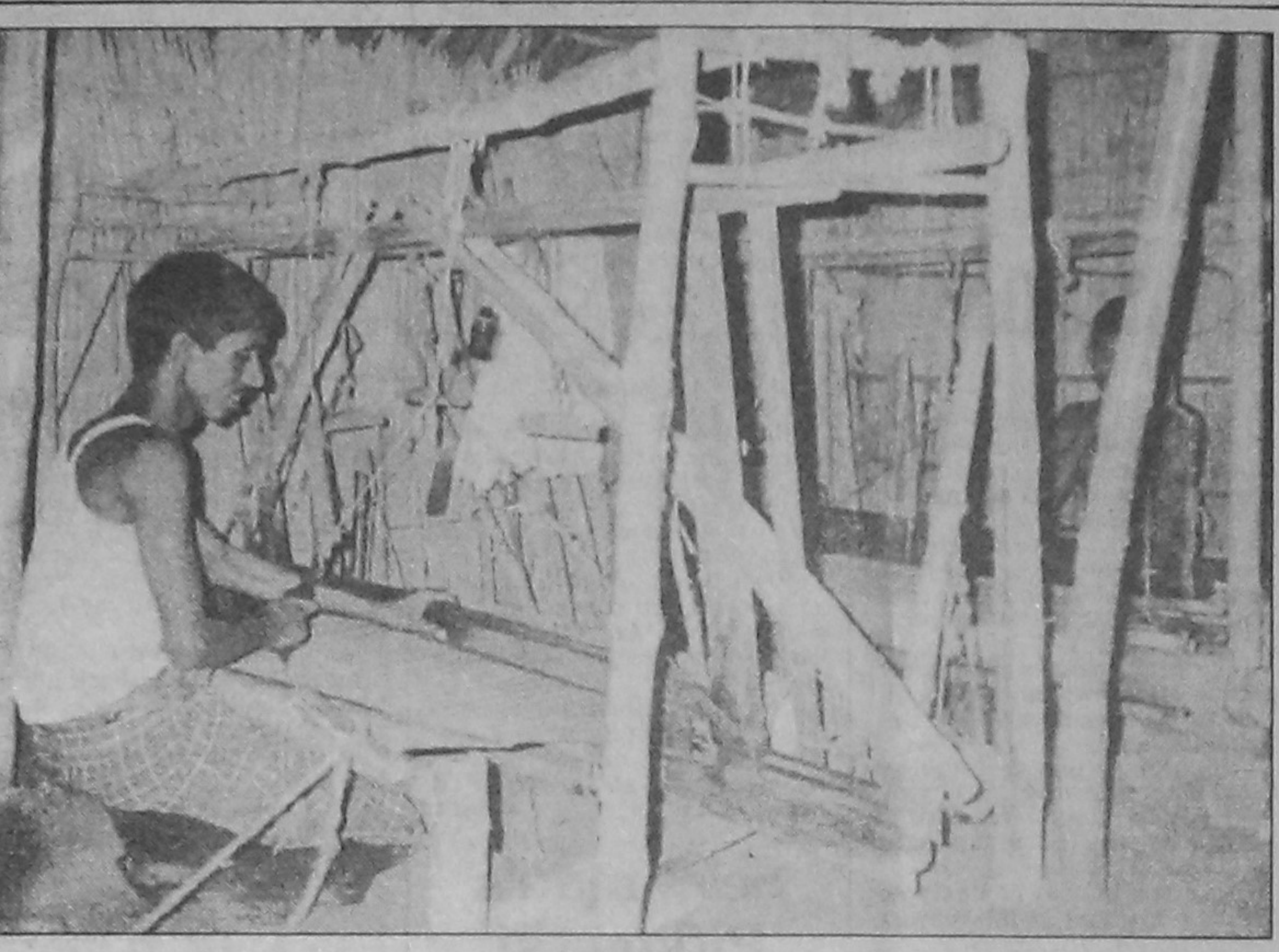
Weavers busy working at a factory in Charshoalmari village under Roumari thana in Kurigram district.