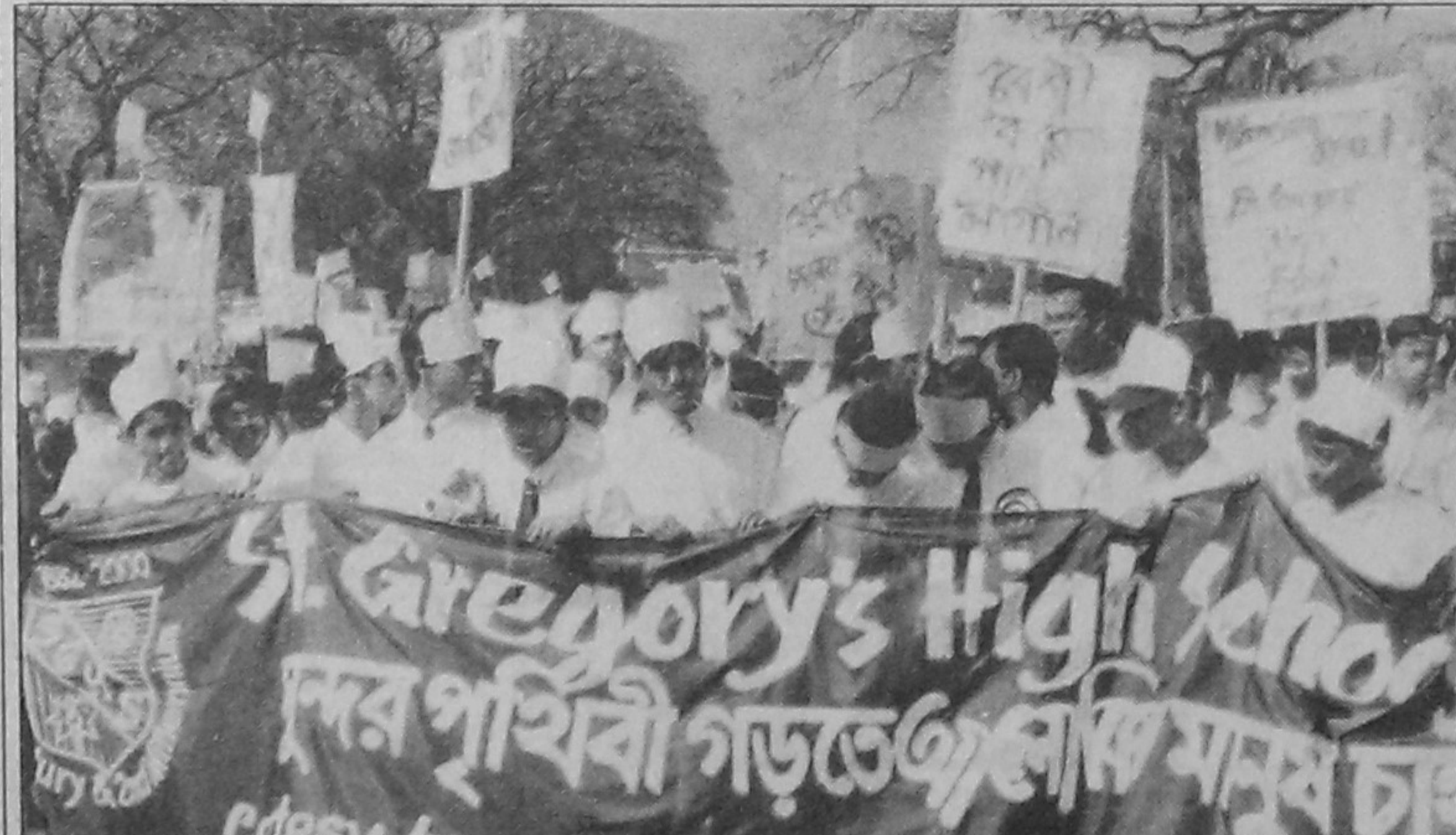
Students of St Gregory's High School brought out a colourful rally in the city yesterday with a banner reading "Enlightened people needed to build a beautiful world." The school was celebrating the dawn of the new millennium.

The injured were taken to Sujanagar thana health complex and Pabna Sadar Hospital. Identities of the victims could not be known immediately.