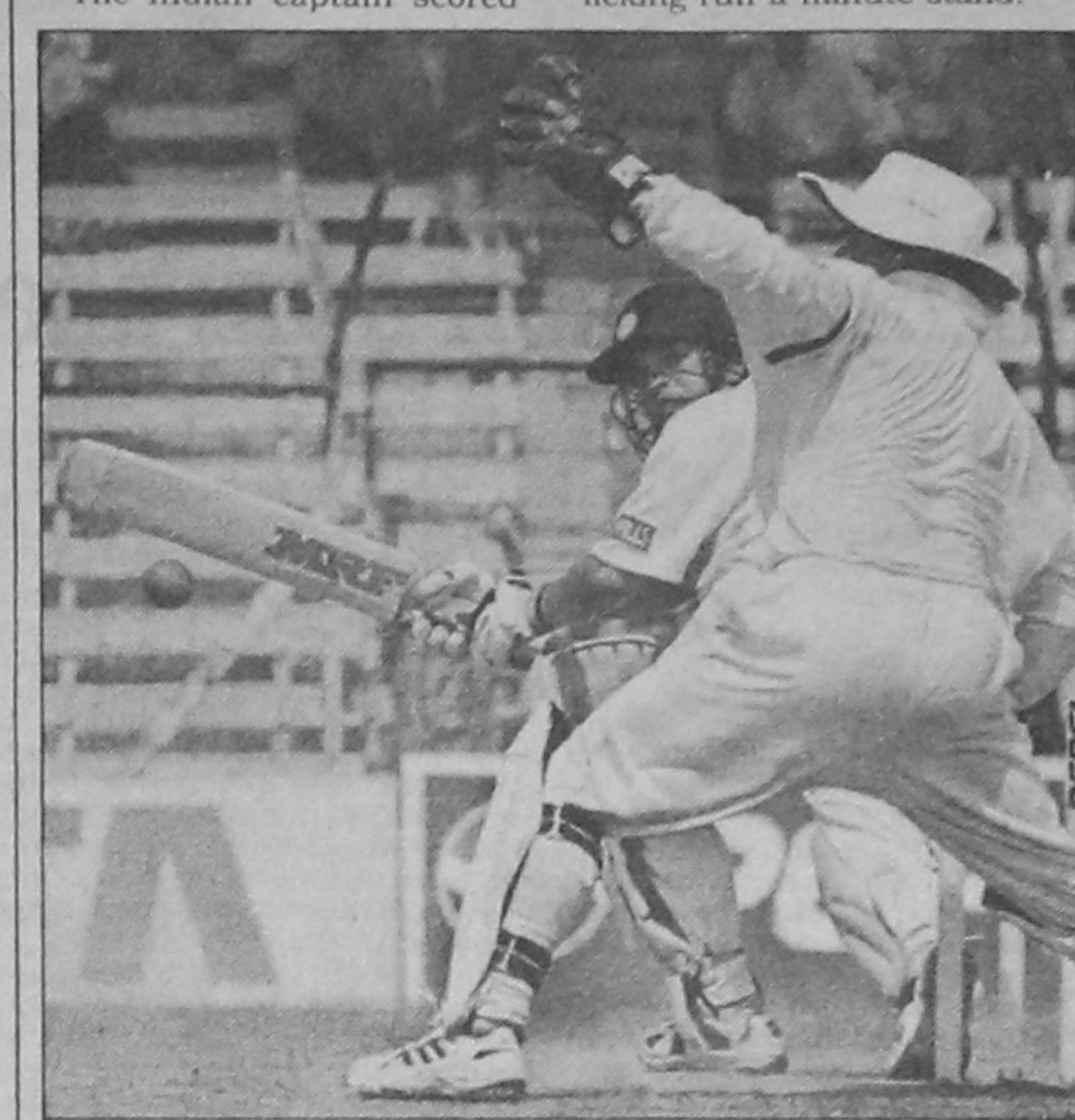
Sachin Tendulkar executing a trademark sweep shot at the Wankhede Stadium in Mumbai yesterday.