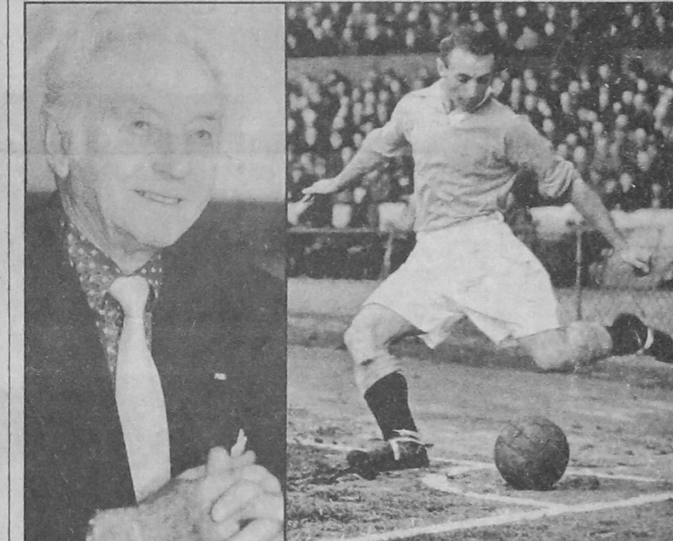
A combination of AFP pictures of Sir Stanley Matthews — a portrait from 1994 (L) and the legend in action in 1951 (R). Sir Stanley died on February 23 at the age of 85.