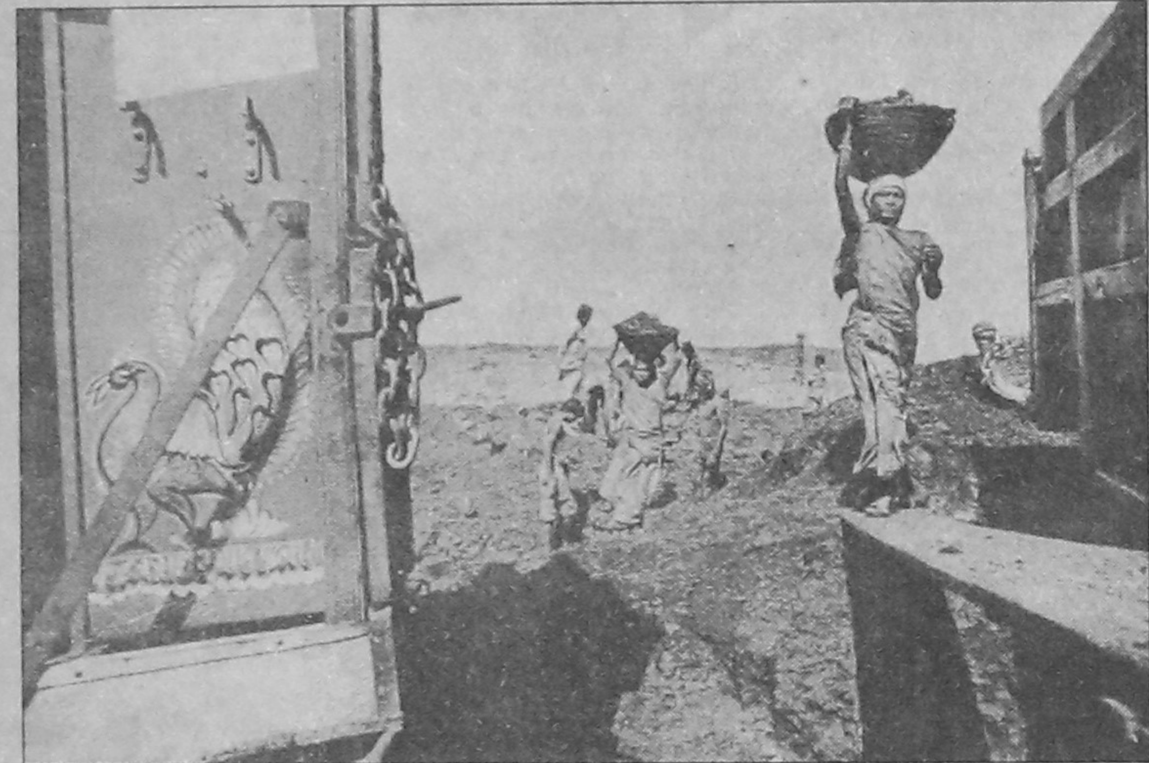
Jharia Coal Fields 1992