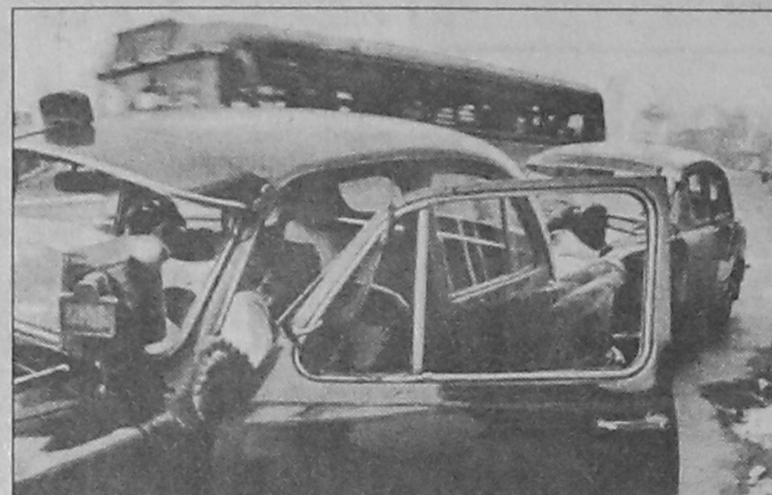
Taxi drivers, Calcutta 1990

vividly captured through Raghu's camera, the dead body being burnt, the people standing beside the 'ghat', the domestic animals lay casually, the water in the background, women hang their clothes on the strings,