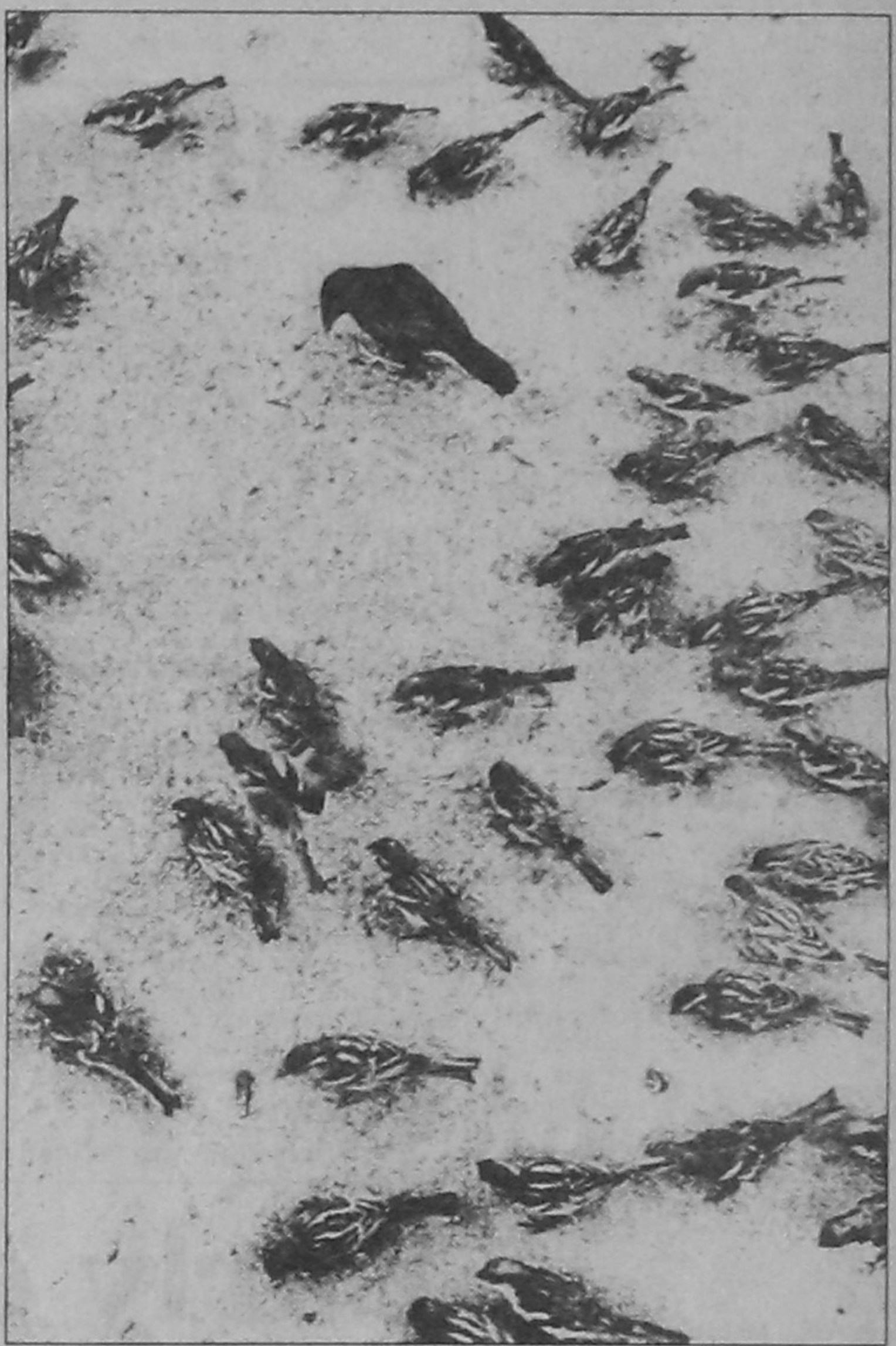
In Sparrows 1966

Raghu travels places from Jaipur, Gujrat, Rajstan to Calcutta, and from Delhi, Pune, Ladak, Varanasi, Ahmedabad, Chandigarh to Maddhya Pradesh and many more places to capture the essence and the spirit of Indian life and in doing so he gave it a universal beauty that can be felt by everyone all over the world.