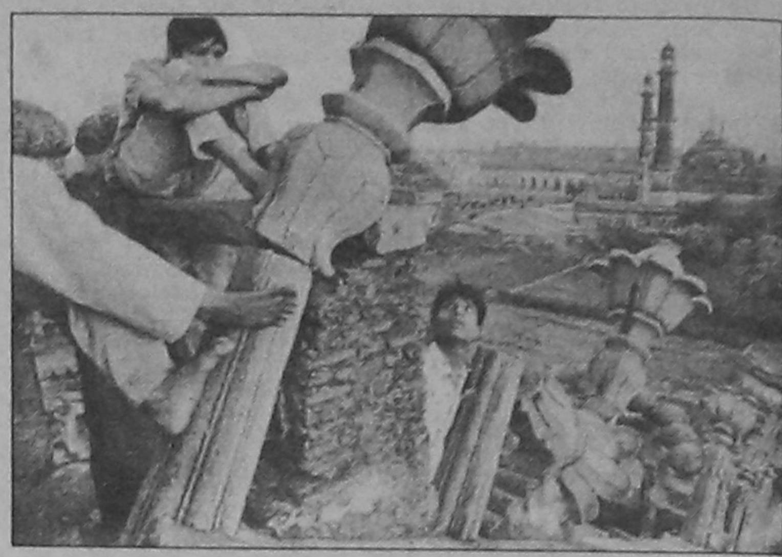
Imambara Lucknow 1992

His poignant images of Mother Teresa have graced the pages of Life, Paris March, Figaro and numerous other well-known magazines. As recogni-