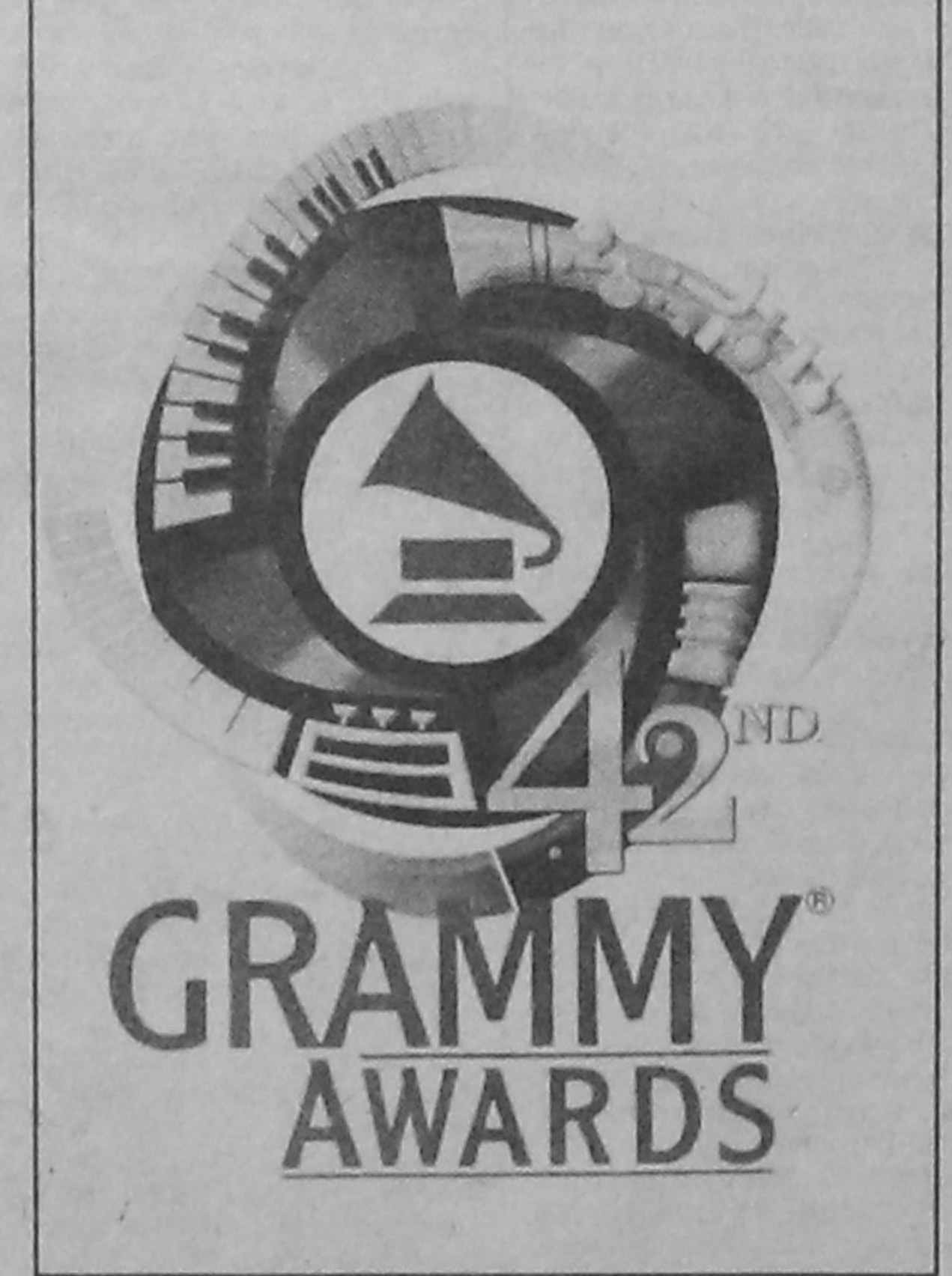
42nd Annual Grammy Awards on Star World at 7:00pm

Magazine 3:30 Travelers 4:30 Ushuaia 5:30 Lonely Planet 6:30 Pop Set 7:00 Splat 7:30 Wild Discovery 8:30 Untamed Amazonia 9:30 Beyond 2000 10:00 Discovery News 10:30 Portrait 11:30 Discovery Profile Series