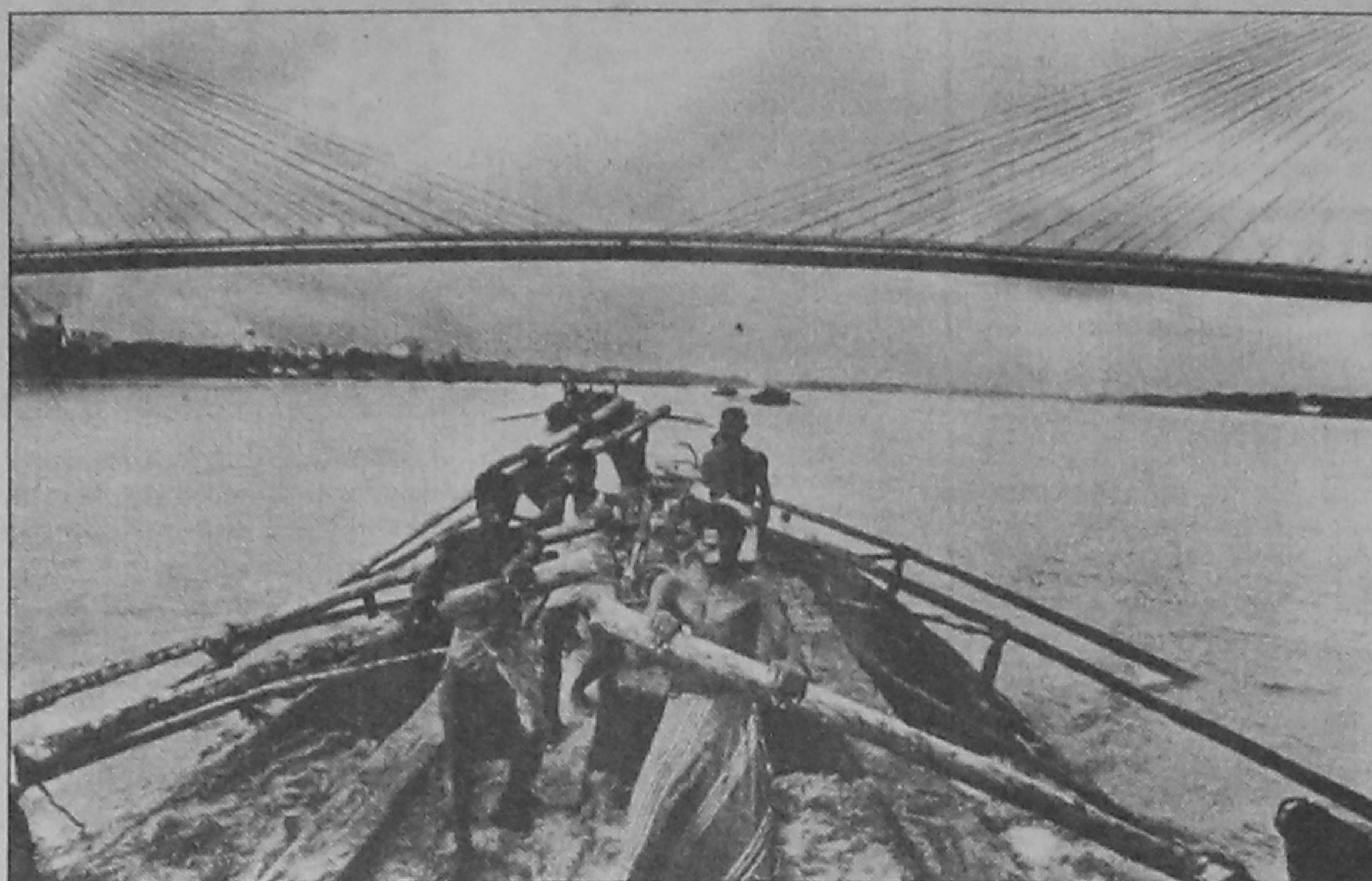
Vidyasagar Setu Bridge 1996

In his 'Holi Celebration by Tribal' the very essence of the celebration is captured beautifully, their smiling faces, the gleaming eyes. The picture as it vibrates the enthusiasm and happiness of those colourful