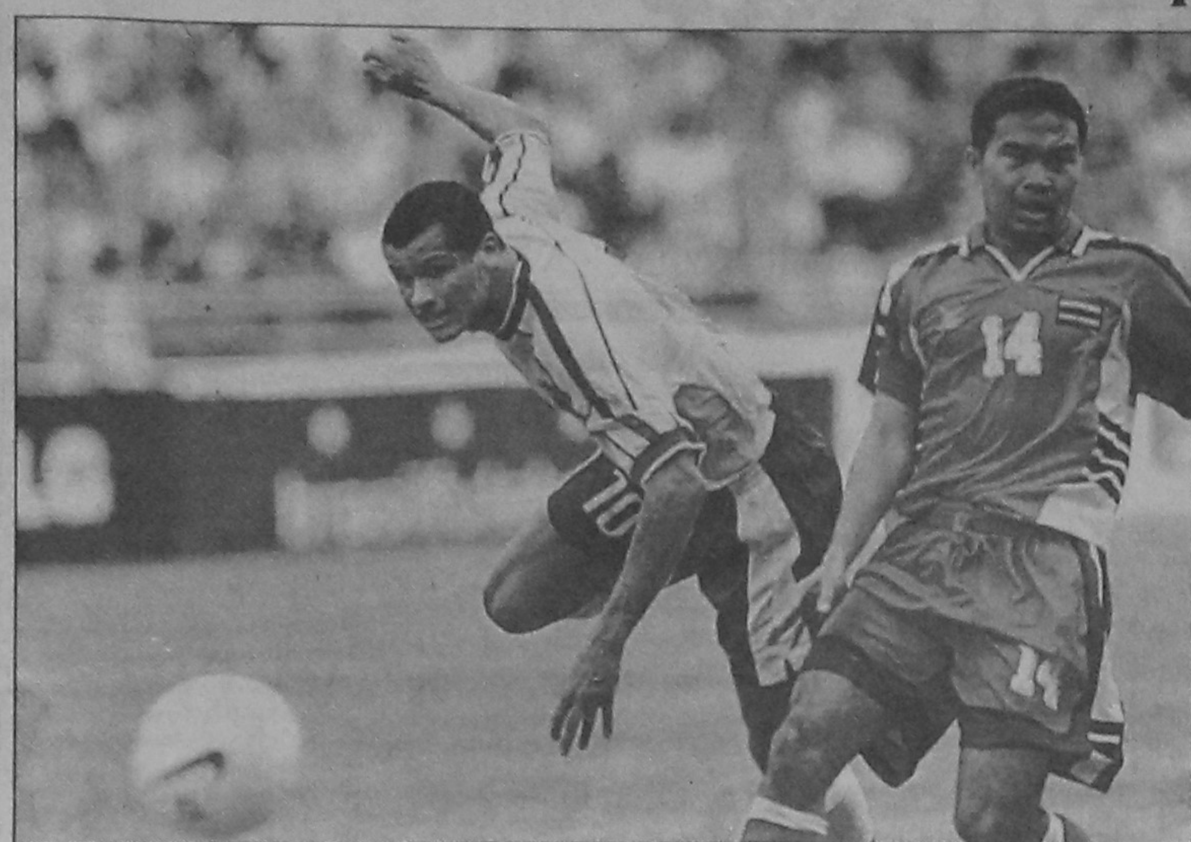
Brazil superstar Rivaldo (L) follows through on a shot during their international friendly against Thailand at Bangkok yesterday.