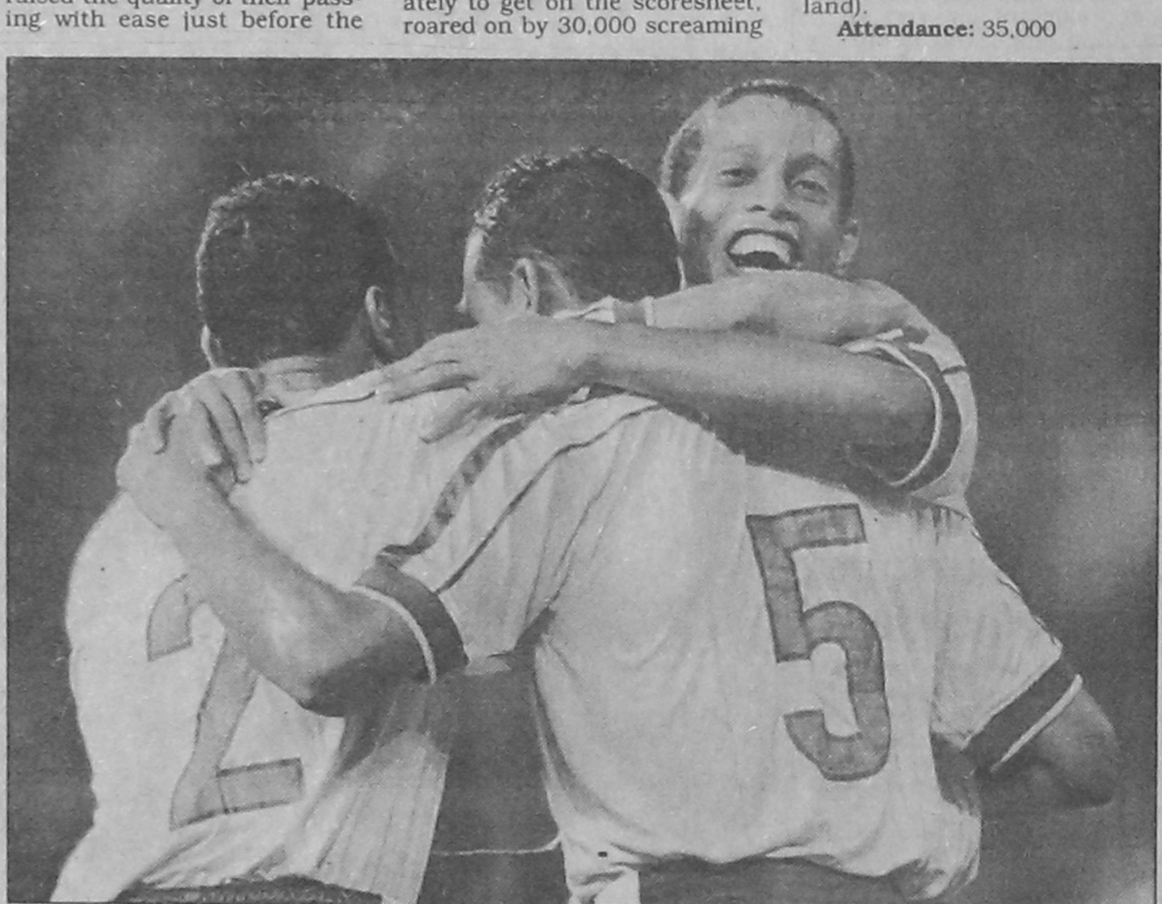
Ronaldinho (R) of Brazil being congratulated by teammates Cafu (L) and Emerson after he scored a goal against Thailand.