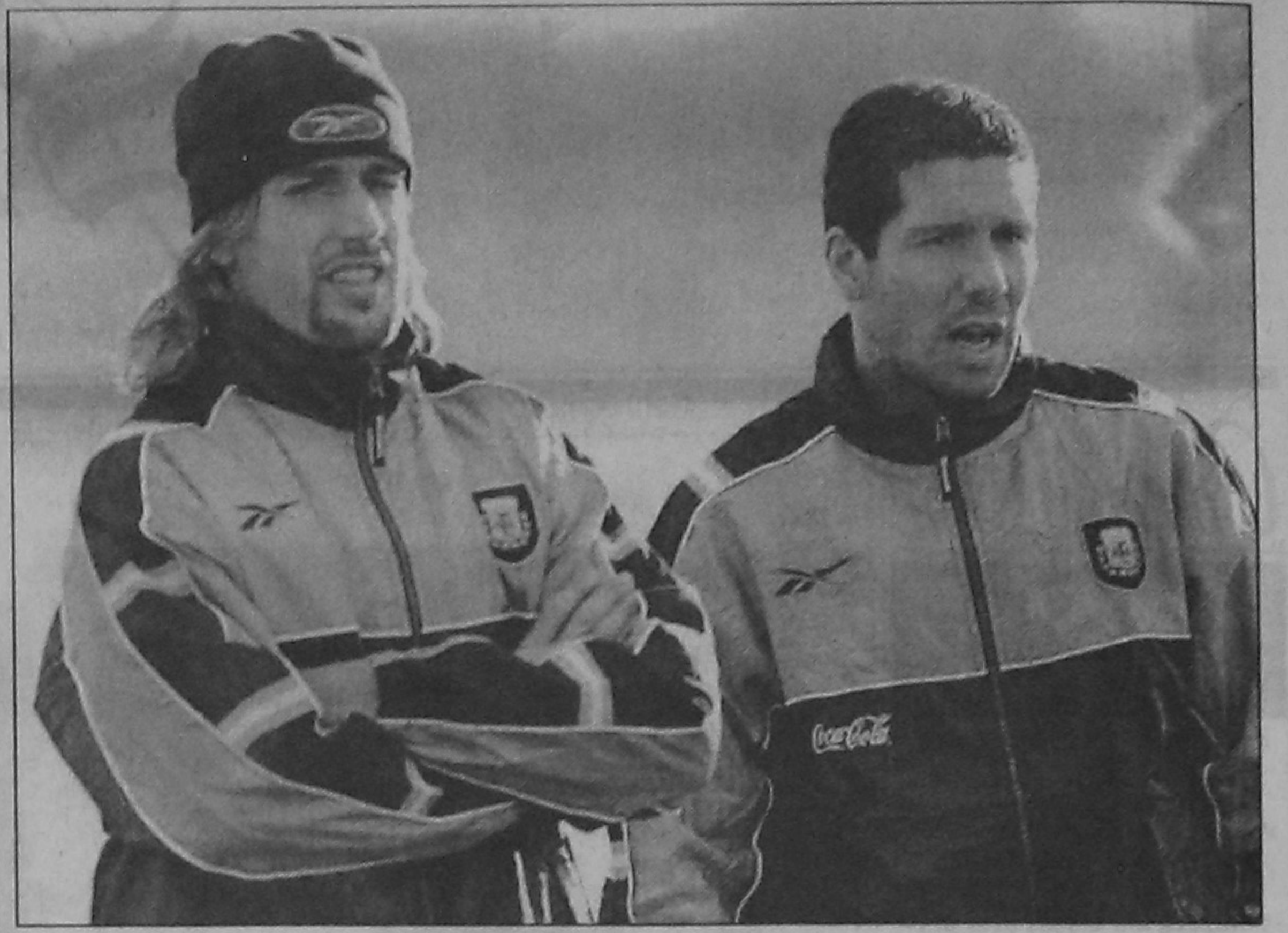
PLOTTING ENGLAND'S DOWNFALL! Argentine superstriker Gabriel Batistuta (L) and midfield hard man Diego Simeone practise at North London on February 21.

THE ONE AND ONLY: German national team coach Erich Ribbeck presents veteran superstar Lothar Matthaeus with a commemorative jersey at Huizen, Netherlands yesterday signifying his world record 144th international cap.