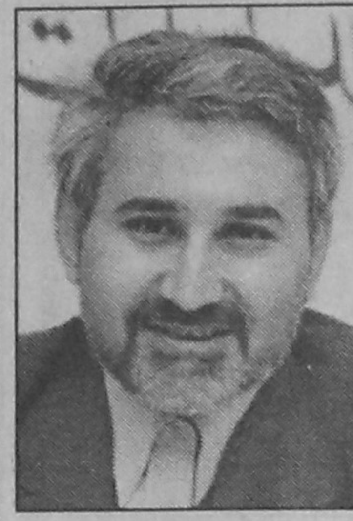
Mohammad-Reza Khatami, the reformers' top candidate, poses for a photo in the office of the Islamic Iran Participation Front (IIPF) in Tehran Sunday as results show the reformers winning 75 per cent of the seats counted so far outside Tehran.

reporters Monday when asked his opinion on opening talks with the United States, with whom Iran has not had relations in over two decades.