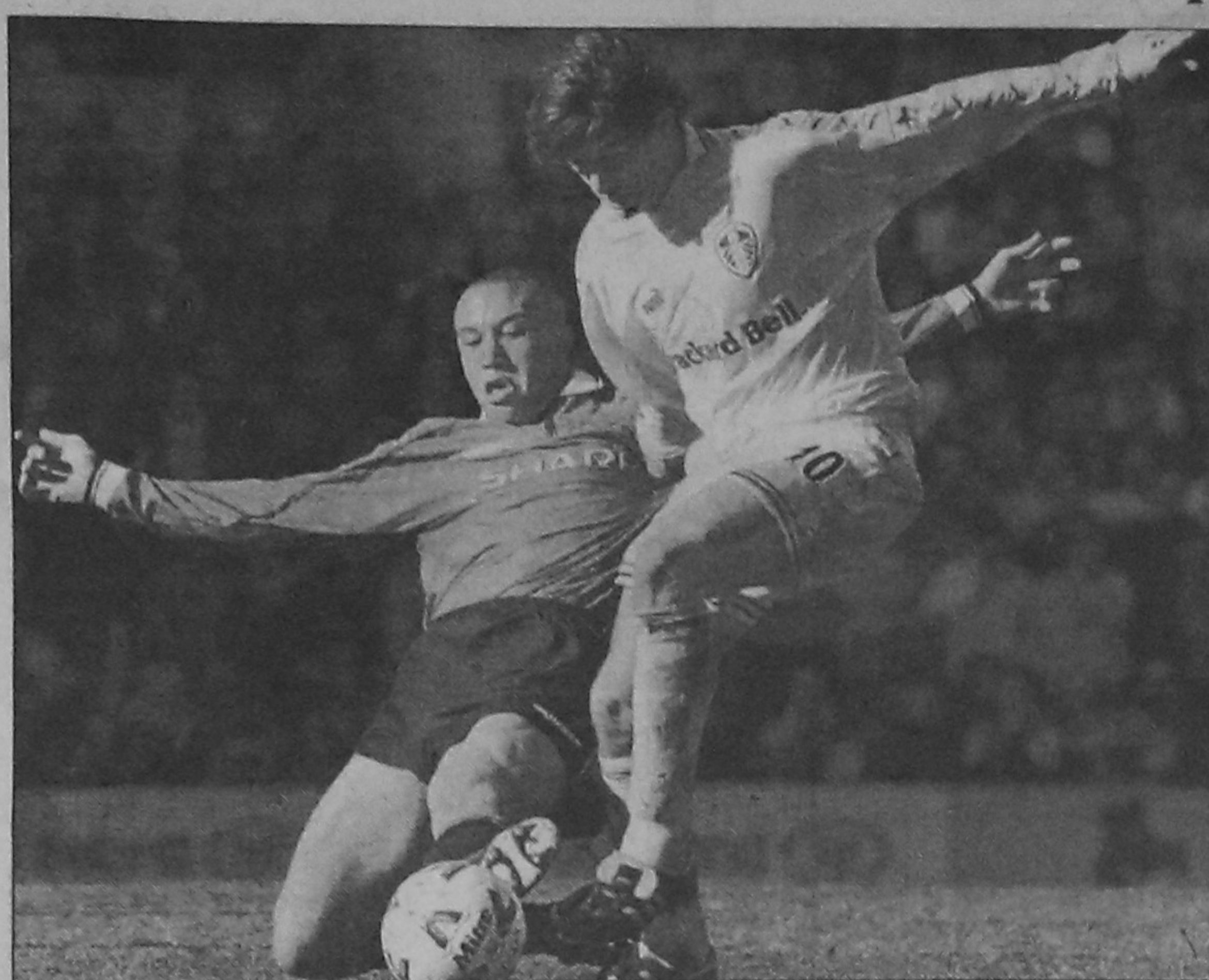
Manchester United's Mikael Silvestre (L) tackling Leeds United's Australian international striker Harry Kewell during their Premiership encounter at Elland Road yesterday.

The Australian squad arrived in Dunedin on Sunday afternoon to prepare for the third day-night match at Carisbrook on Wednesday.