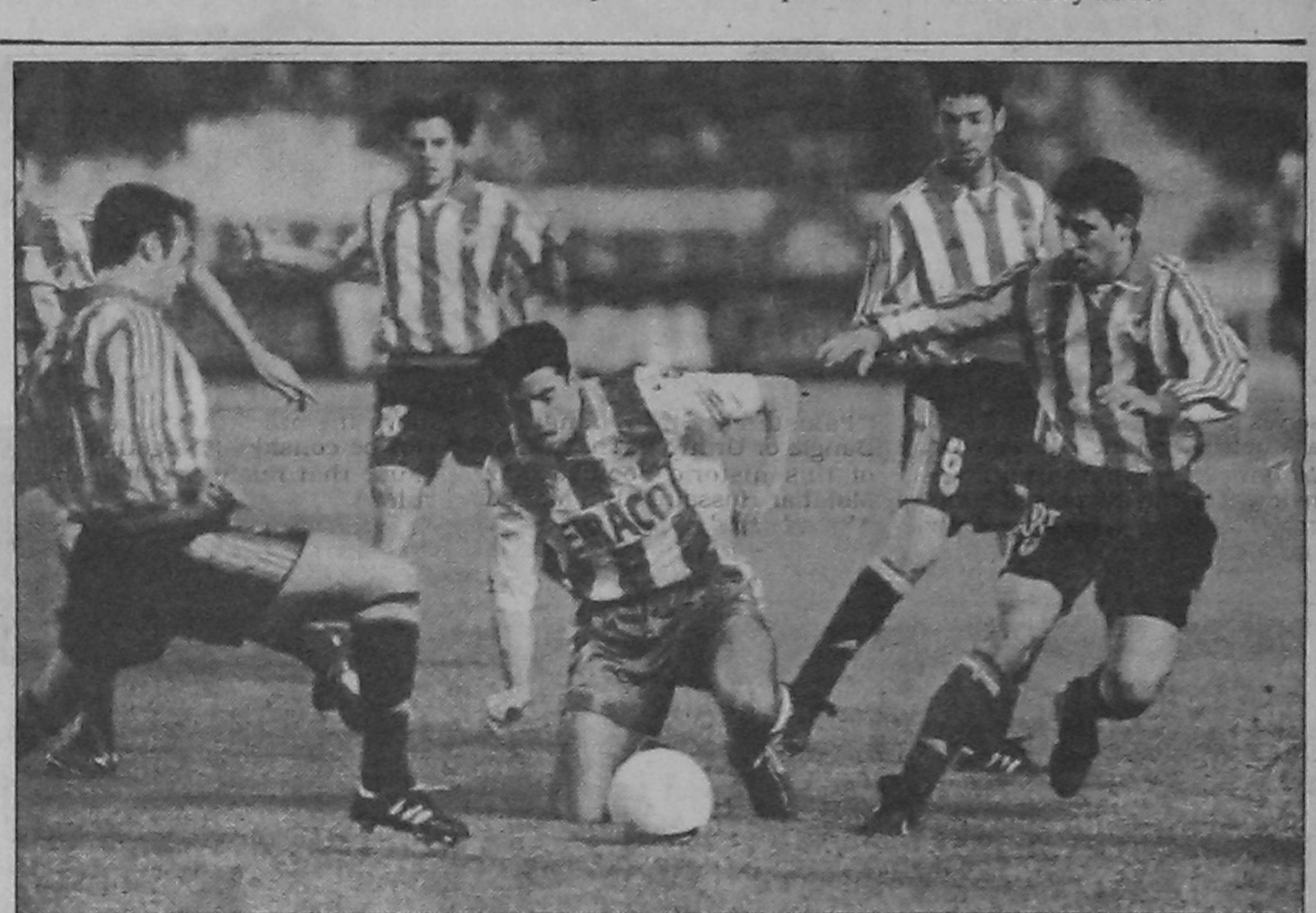
Roy-Makkaay (C), Deportivo la Coruna's Dutch international finds himself caged by a host of Athletic Bilbao defenders during their Primera Liga match at La Coruna on February 19.