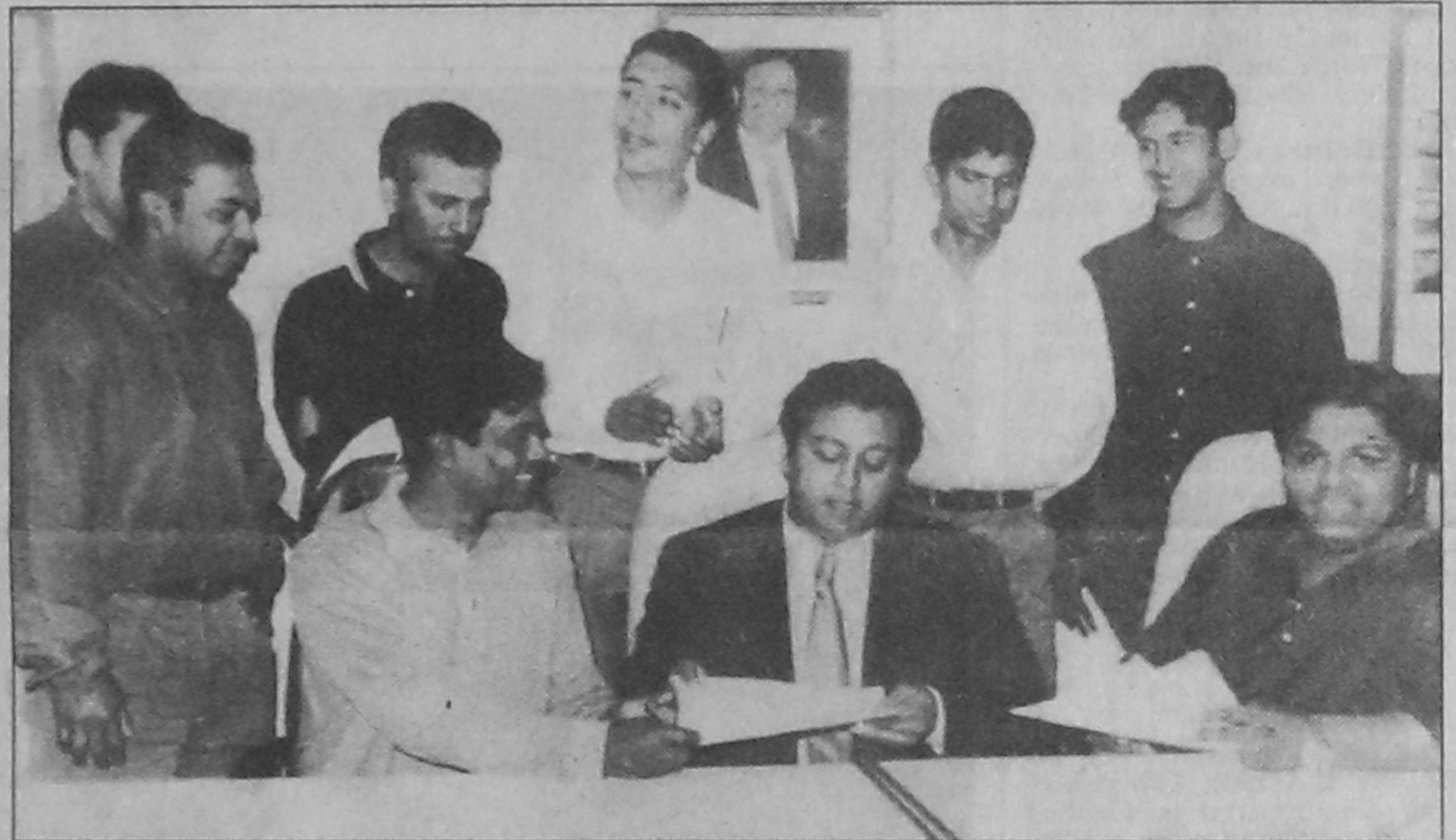
National cricket team captain Aminul Islam (sitting L) and a Bashundhara Group official exchange papers after signing a sponsorship deal yesterday.