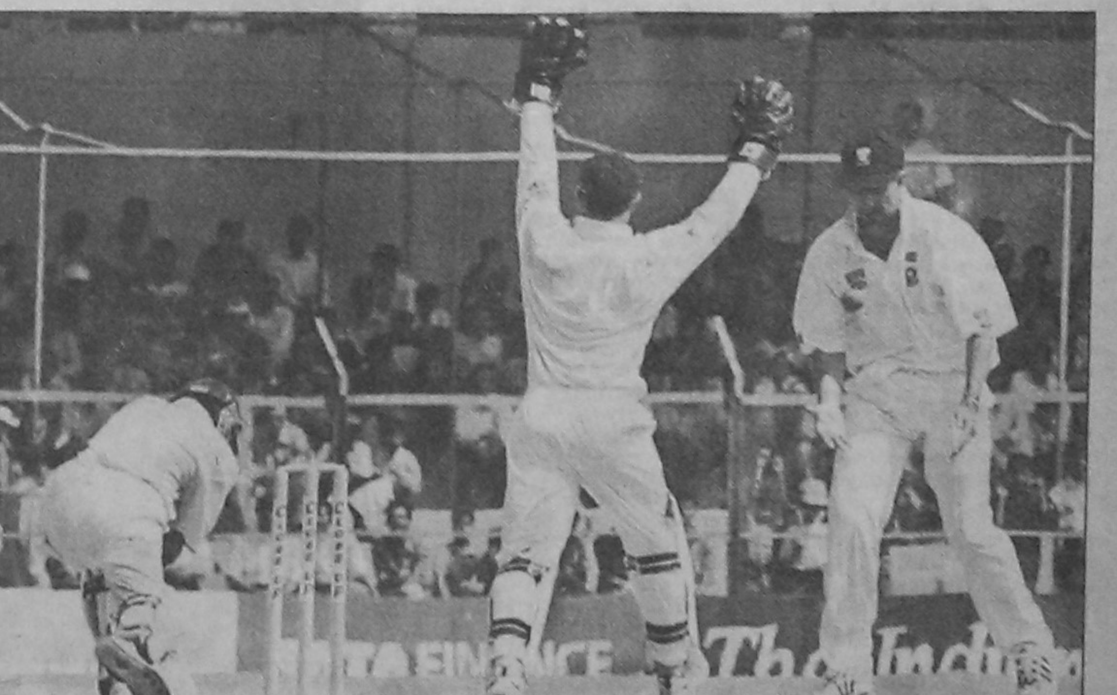
South African wicketkeeper Mark Boucher (C) gets excited as the ball travels towards skipper Hansie Cronje brushing Ajay Jadeja's pads on the second day of the three-day tour match at Bombay yesterday.