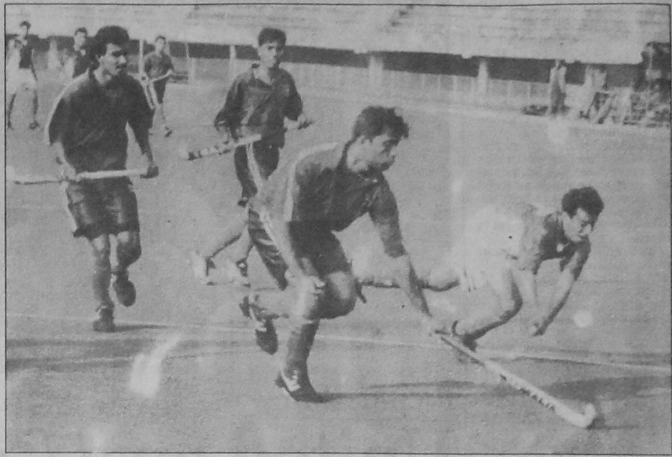
Action from the Office Hockey League match between Blue Berry Travels and Sonali Bank at the Maulana Bhasani National Stadium yesterday.